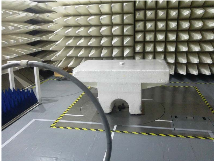
Photograph No.1 Setup for spurious emission field strength measurements in the anechoic chamber below 30 MHz