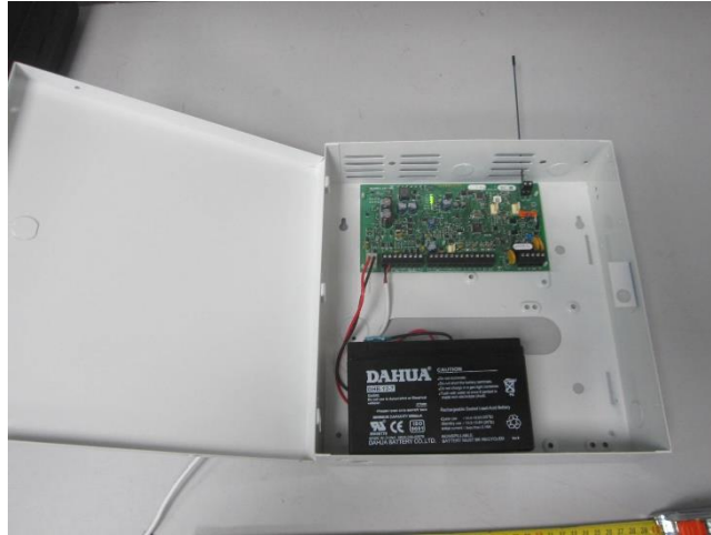
Photograph No.1 Internal view