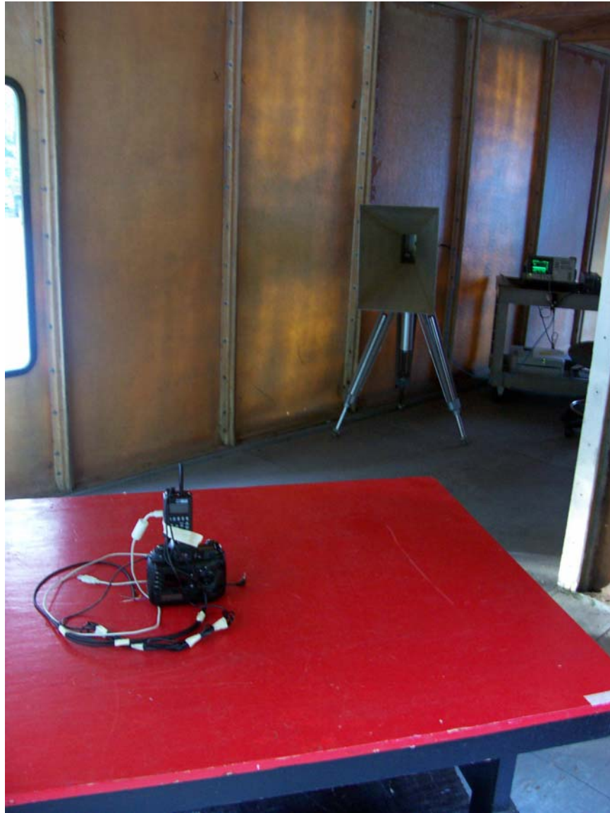
Radiated Emissions Setup Photograph

R-4901N-1 FCC ID: KDS-PW2-101 IC: 2170A-PW101