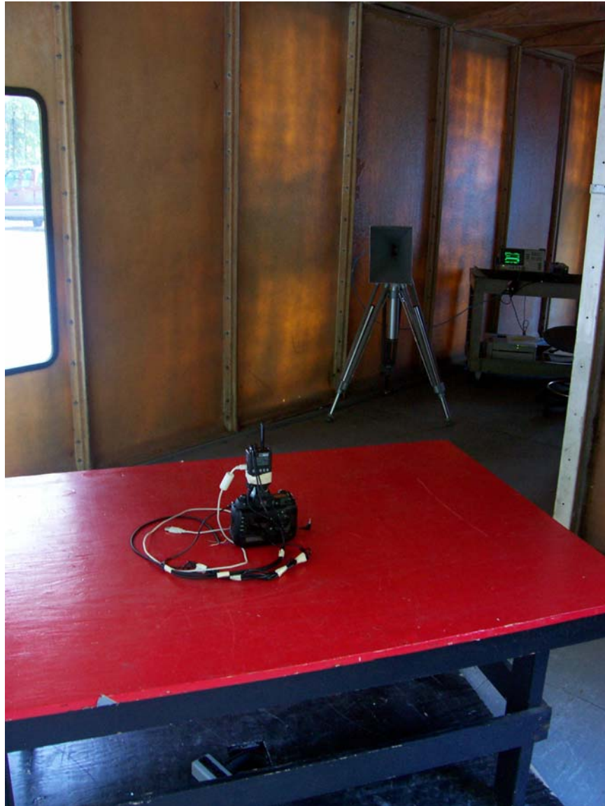
Radiated Emissions Setup Photograph

R-4901N-1 FCC ID: KDS-PW2-101 IC: 2170A-PW101