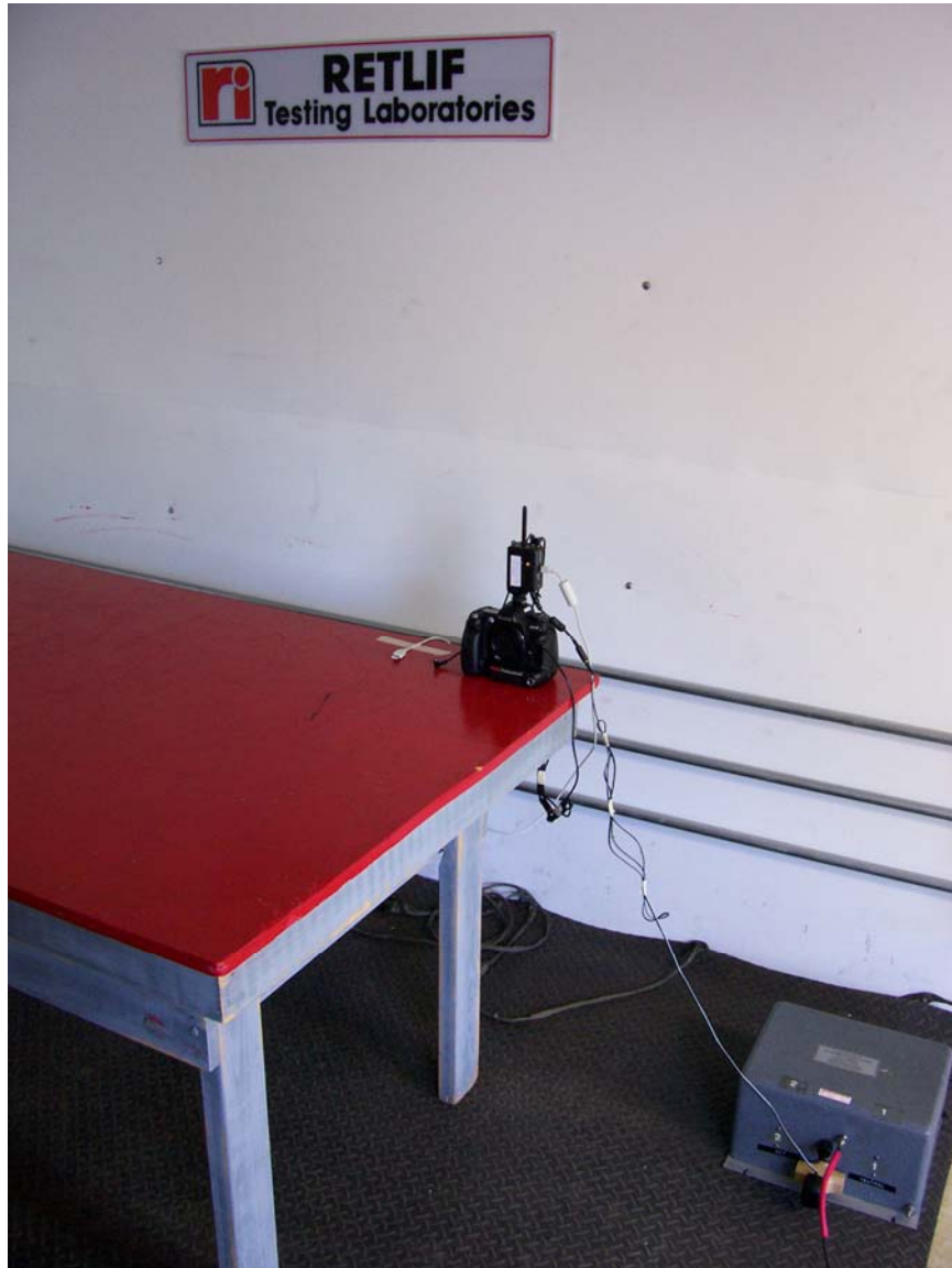
Conducted Emissions Setup Photograph

R-4901N-1 FCC ID: KDS-PW2-101 IC: 2170A-PW101