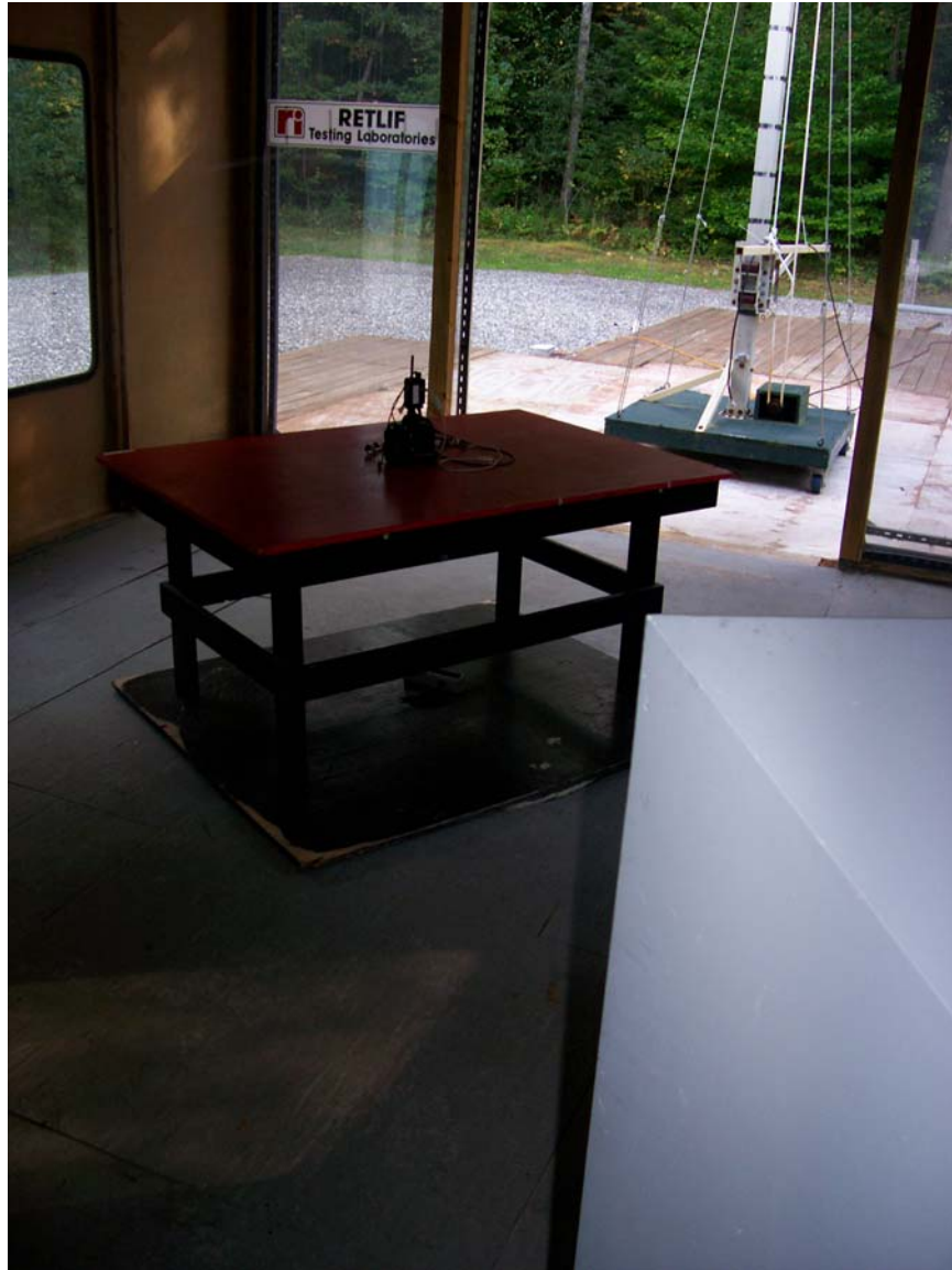
Radiated Emissions Setup Photograph

R-4901N-1 FCC ID: KDS-PW2-101 IC: 2170A-PW101