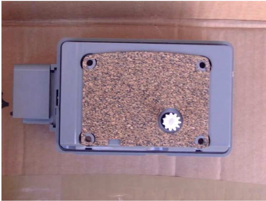
Figure 1 Rear View