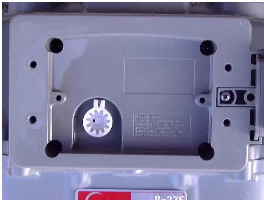
Figure 2 Front Panel Rear View