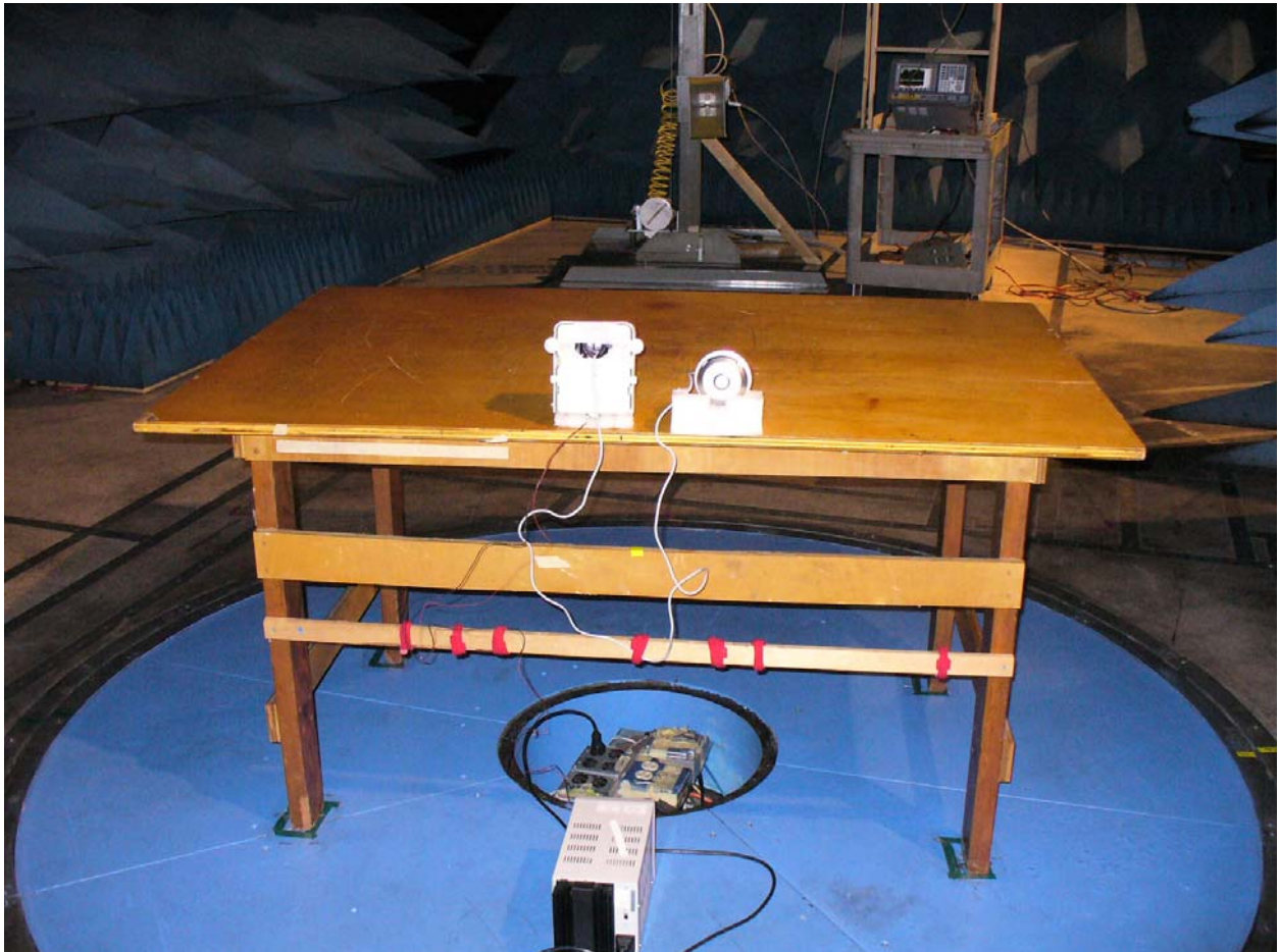
Figure 2: Radiated Emissions – Back View