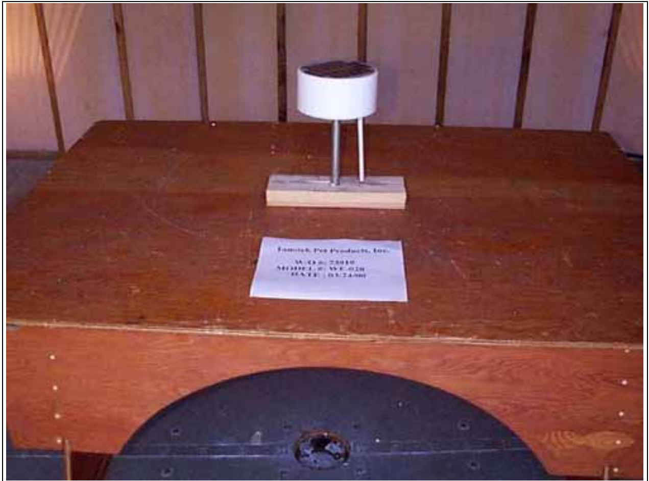
Radiated Emissions - Front View