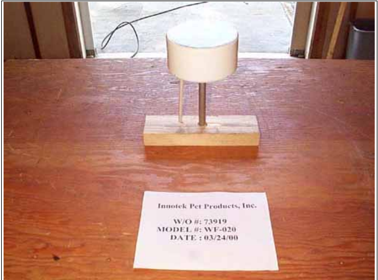
Radiated Emissions - Back View