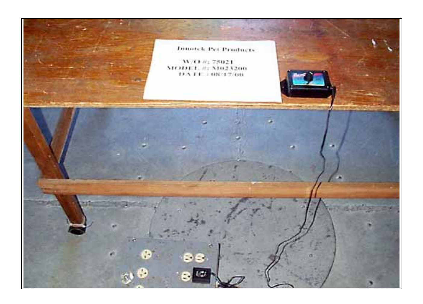
Radiated Emissions - Back View