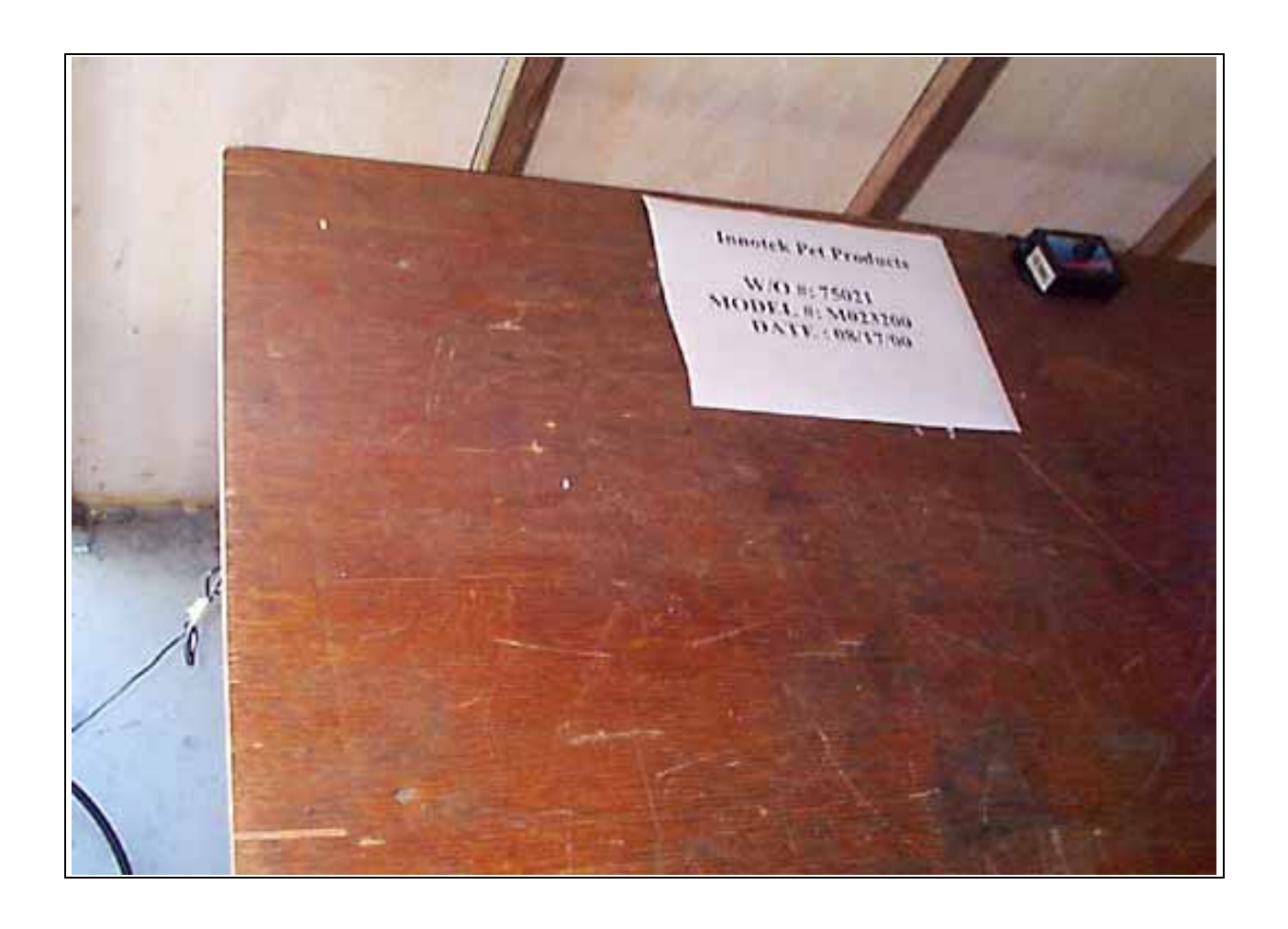
Conducted Emissions - Front View