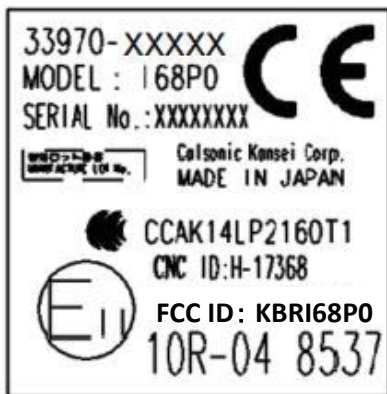
TYPE - A