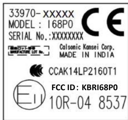
TYPE - B