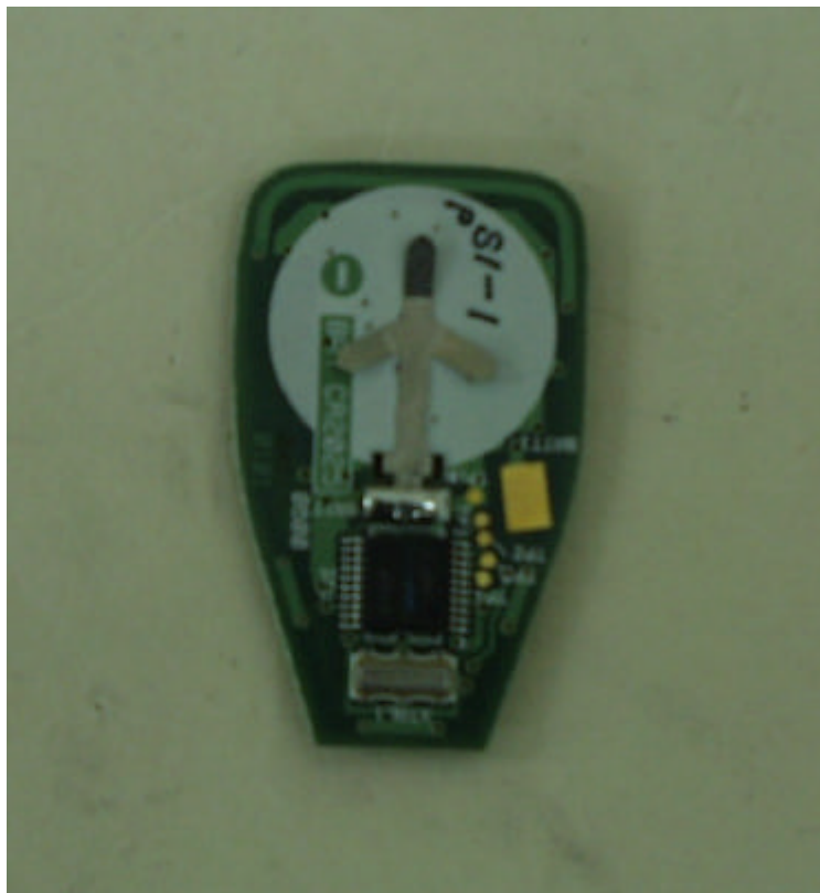
Circuit Board (Back)