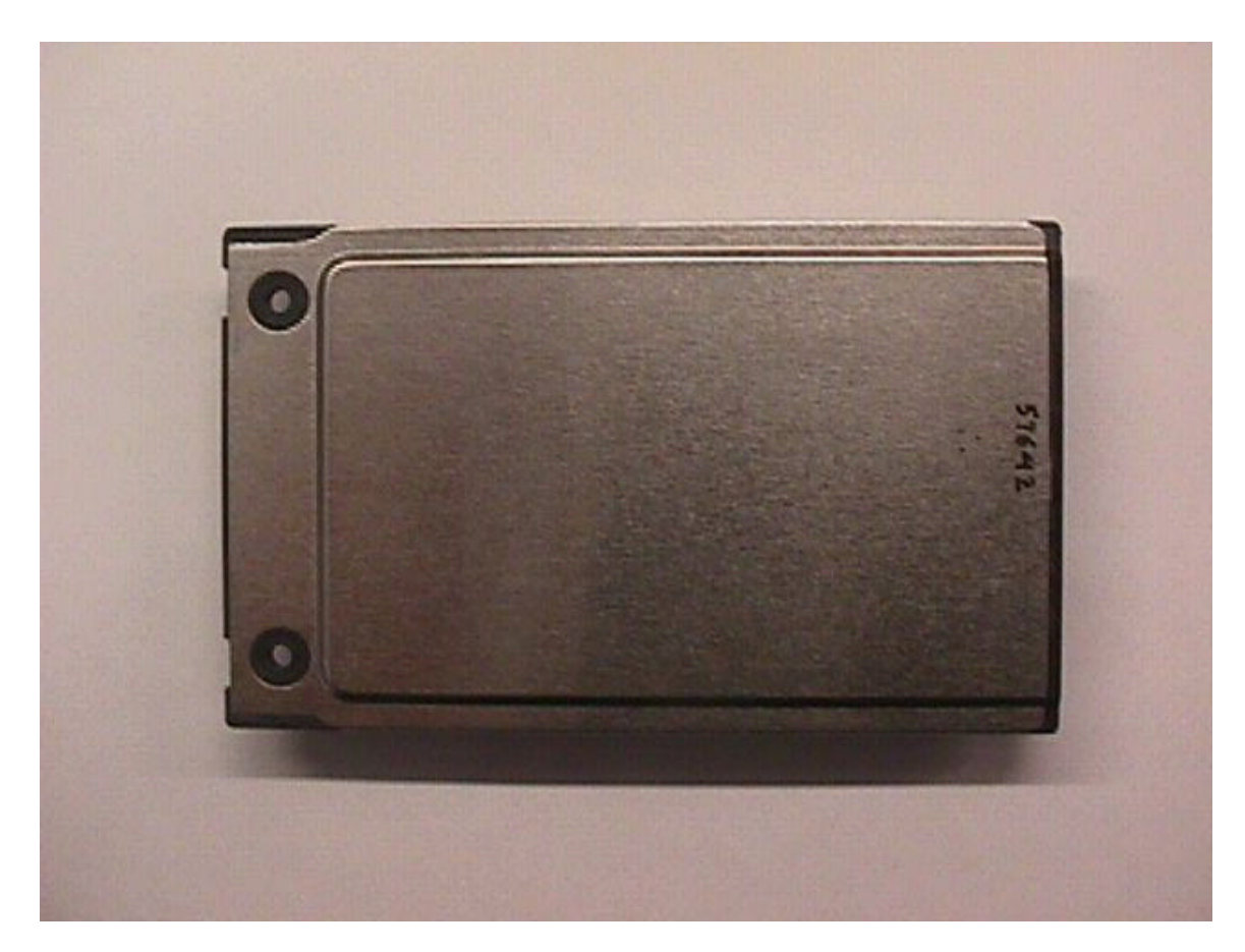
Figure 2: Modem External View – Bottom Side