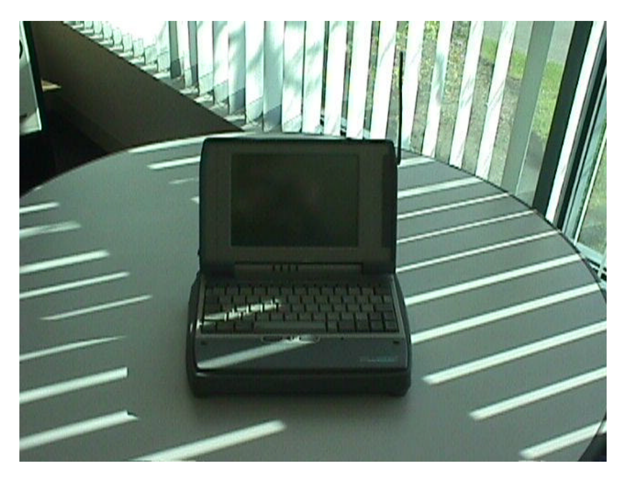
Figure 3: Itronix XC6250 laptop