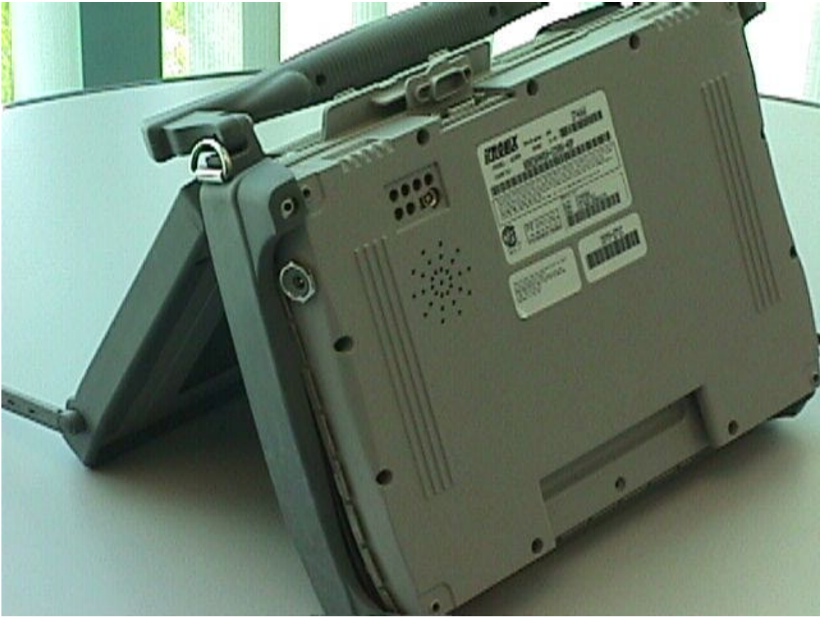
Figure 2: Location of the FCC Approval label