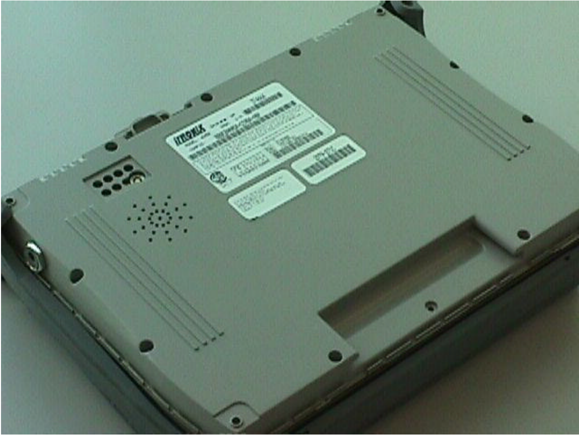
Figure 1: Location of the FCC Approval label