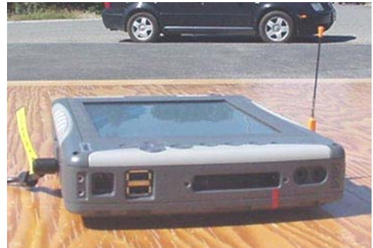
Photograph B.7-6 - DUT "LCD Face-Up" Configuration Close-up