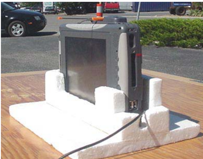
Photograph B.7-7 - DUT "Landscape" Configuration Close-up