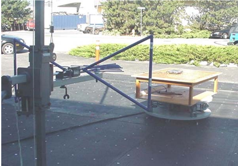
Photograph B.7-5 - Bilog Receive Antenna with DUT Antenna - DUT "LCD Face-Up" Configuration