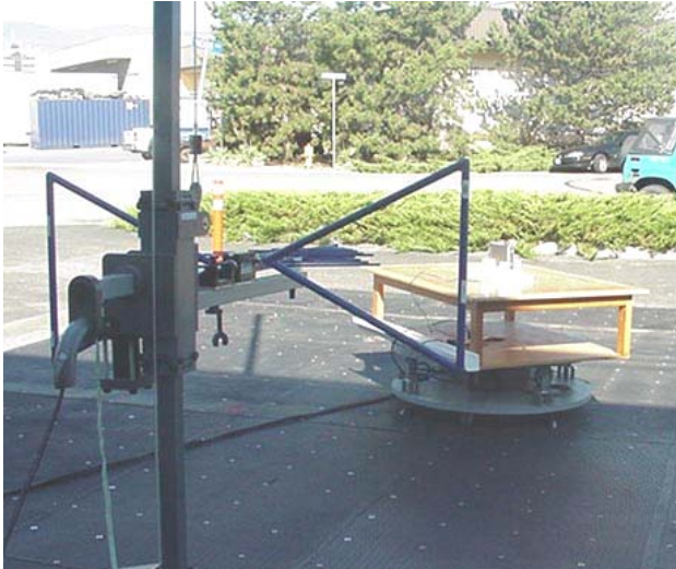
Photograph B.7-1 - Bilog Receive Antenna with DUT Antenna - DUT "Landscape" Configuration