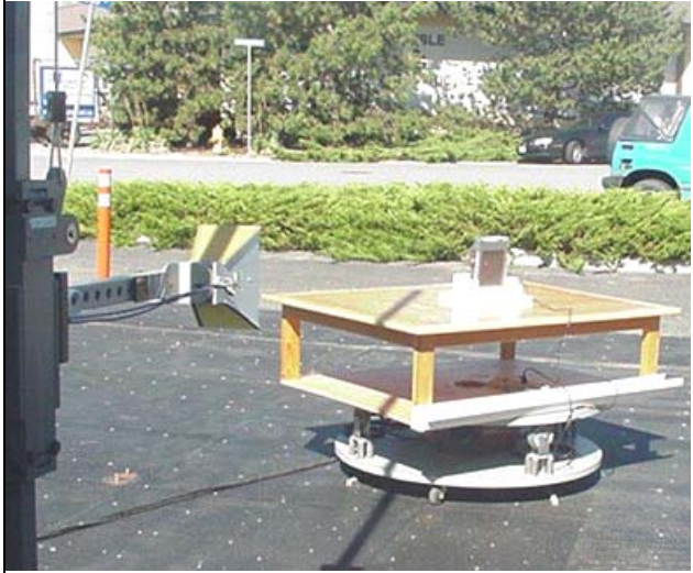
Photograph B.7-2 - Horn Receive Antenna with DUT Antenna - DUT "Portrait" Configuration