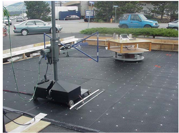
Photograph E-2 - Bilog Antenna (30 MHz - 1 GHz) @ 3m