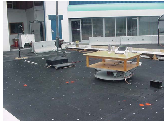
Photograph D-2 - 3115 Horn with LNA/Filter @ 1m