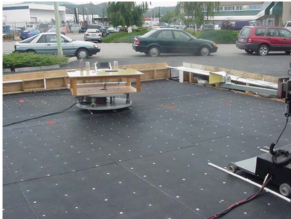
Photograph D-1 - 3115 Horn @ 3 m