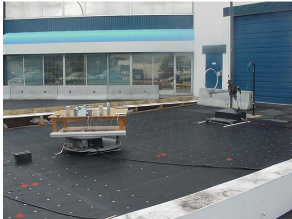
Photograph E-1 - Loop Antenna (10kHz - 30 MHz) @ 3m