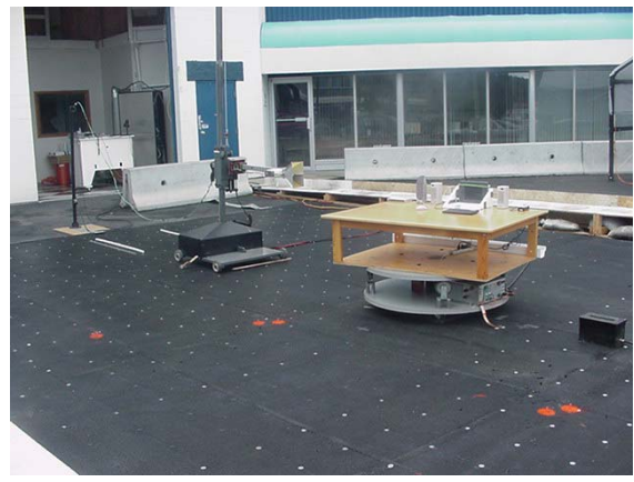
Photograph E-4 - 3115 Horn with LNA/Filter @ 1m