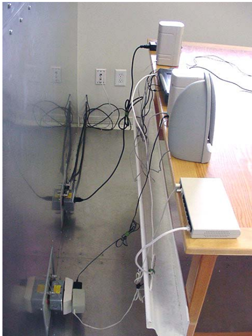
Photograph G-2 - AC Powerline Conducted Emission Configuration