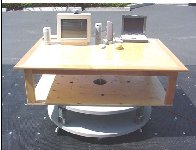
Photograph E-3 - Front of Radiated Emission Configuration