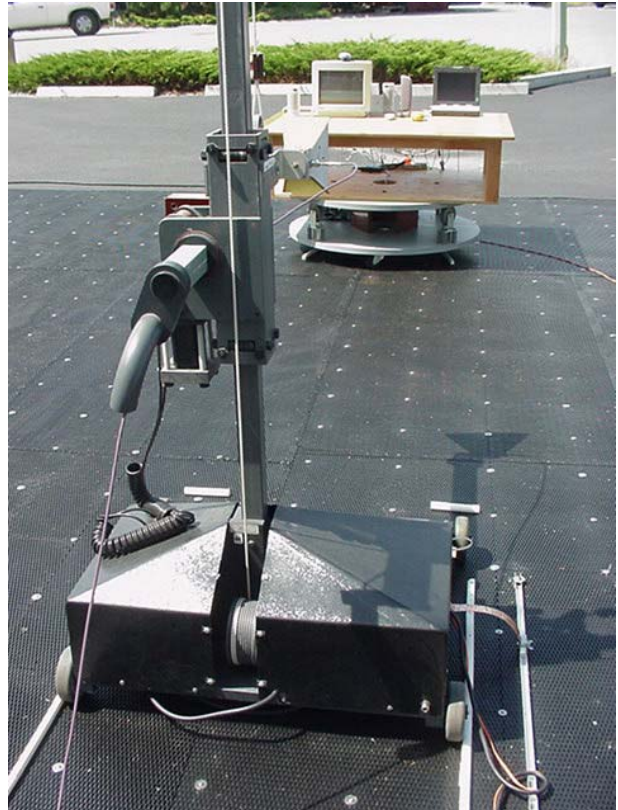
Photograph E-2 - Vertical Polarization (30MHz – 1 GHz)