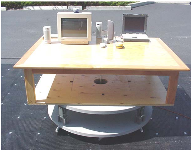
Photograph E-3 - Front of Radiated Emission Configuration