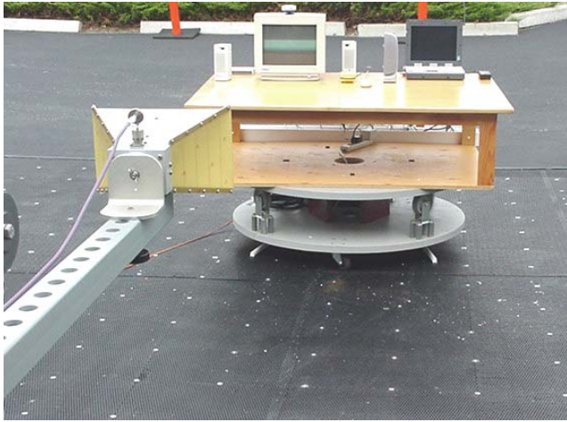
Photograph D-1 - Vertical Polarization (1-18 GHz)