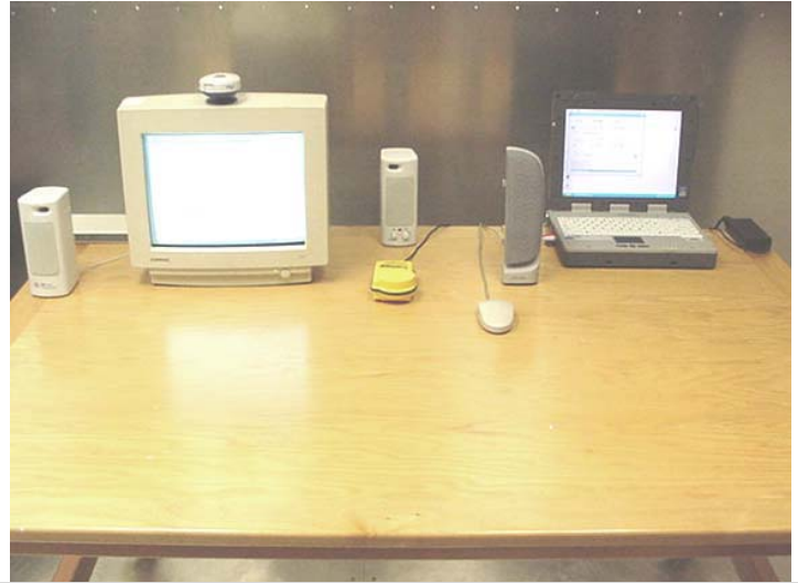
Photograph G-2 – AC Powerline Conducted Emission Cable Placement