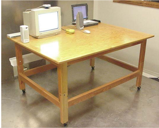
Photograph G-1 – AC Powerline Conducted Emission Configuration