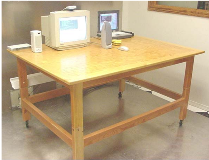
Photograph H-1 - AC Powerline Conducted Emission Configuration