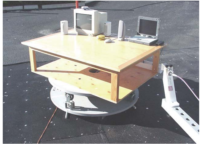
Photograph E-2 - Vertical Polarization (18-26 GHz)