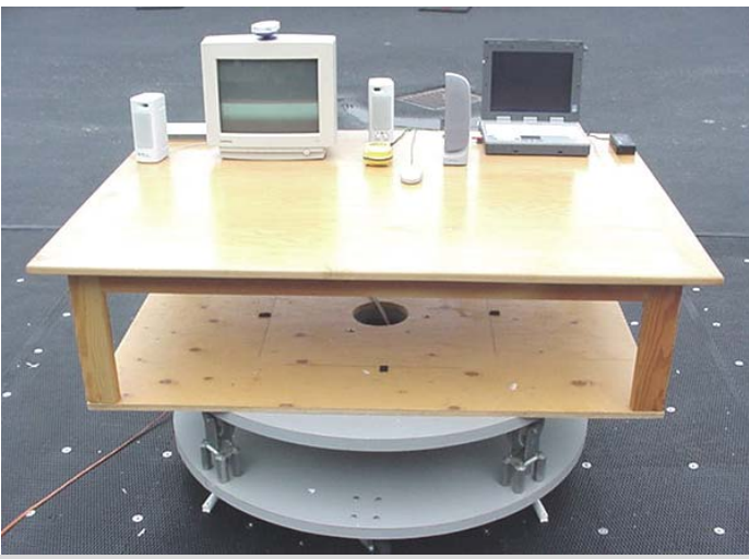
Photograph F-3 - Front of Radiated Emission Configuration