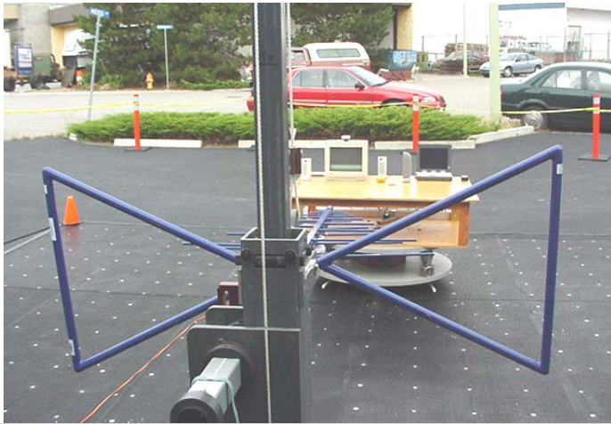
Photograph F-1 - Horizontal Polarization (30MHz - 1 GHz)