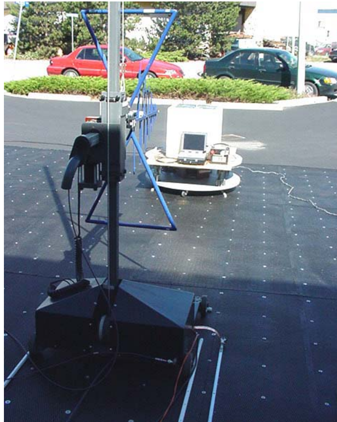
DUT Cellular Band with Bilog antenna