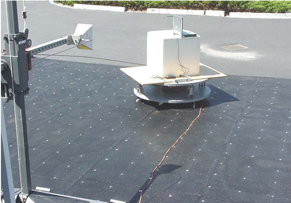
DUT PCS Band with Horn antenna