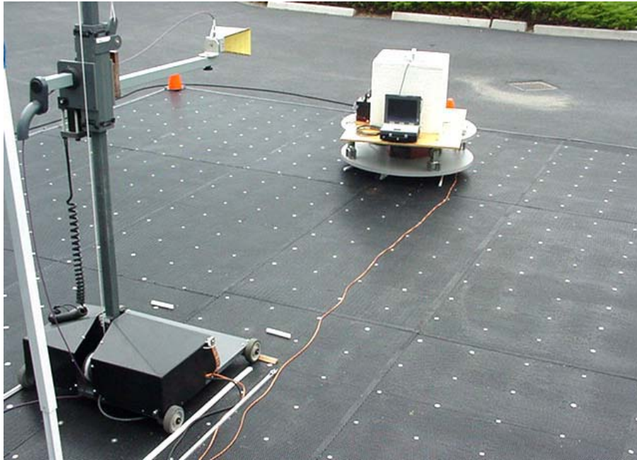
DUT PCS Band with Horn antenna