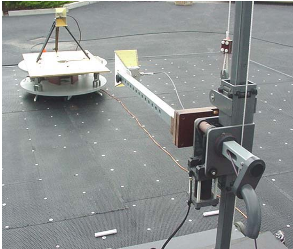
Substitution Horn antenna