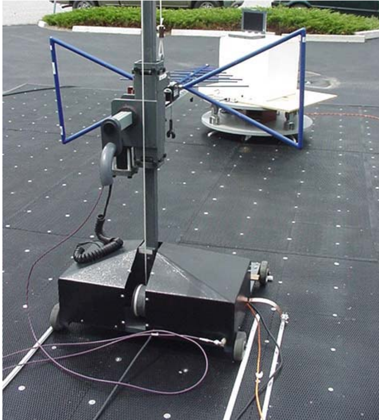
DUT Cellular Band with Bilog antenna