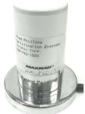
MaxRad 3 dBi Gain Vehicle-Mount Antenna P/N: WMLPVDB800/1900