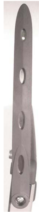
Itronix IX260+ Swivel Dipole Antenna