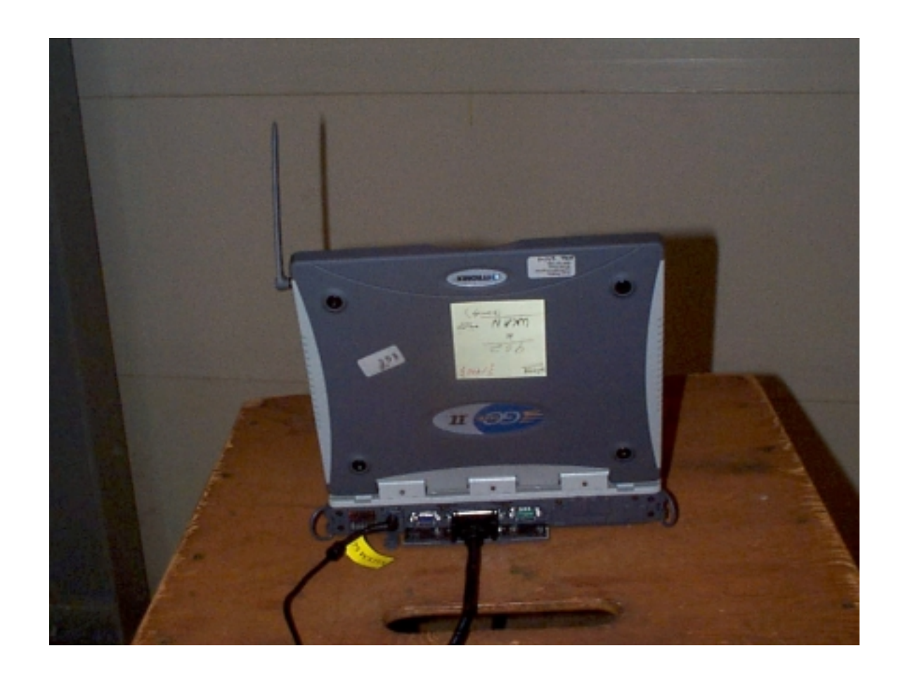
Exhibit 7 4

Rear View of IX260 PC – WLAN antenna located internally in the upper right and left side of display. External Blade antenna is for RIM902M-2-0.