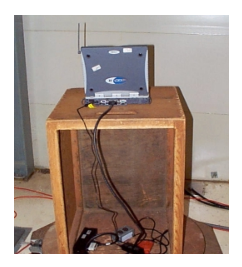
Exhibit 7 5

Rear View of IX260 PC – WLAN antenna located internally in the upper right and left side of display. External Blade antenna for RIM902M-2-0. An ITRONIX Breakout Box P/N 500116-001 was connected to the multi I/O port on the IX260, to accomodate the RIMKEY ID#205 for FCC type testing that was plugged into the parallel port on the Breakout Box that was located on the lower table surface.