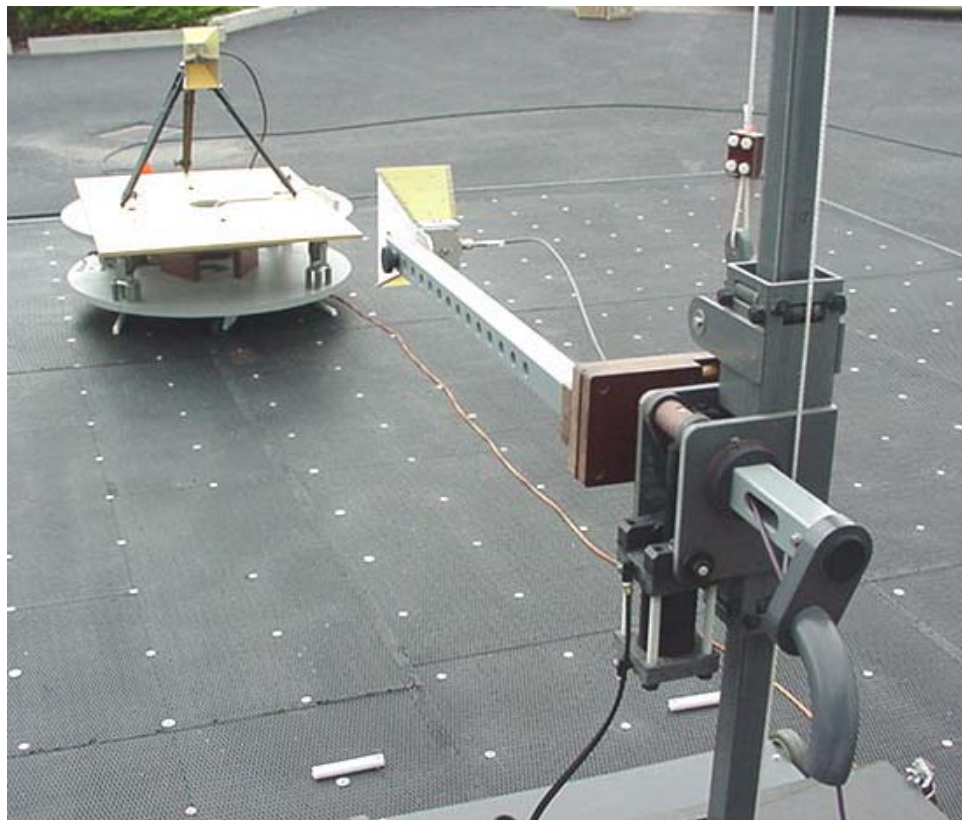
Substitution Horn antenna