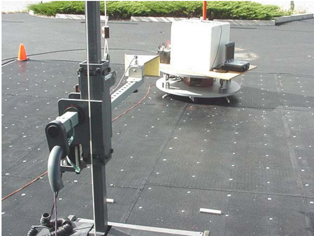
DUT PCS Band with Horn receive antenna