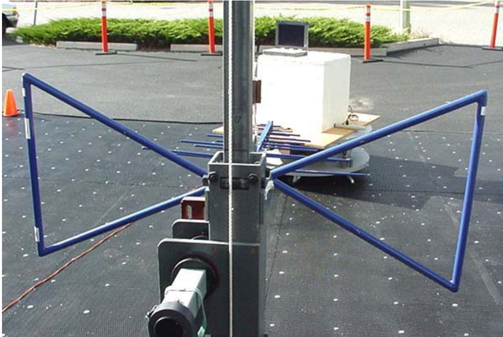
DUT Cellular Band with Bilog receive antenna