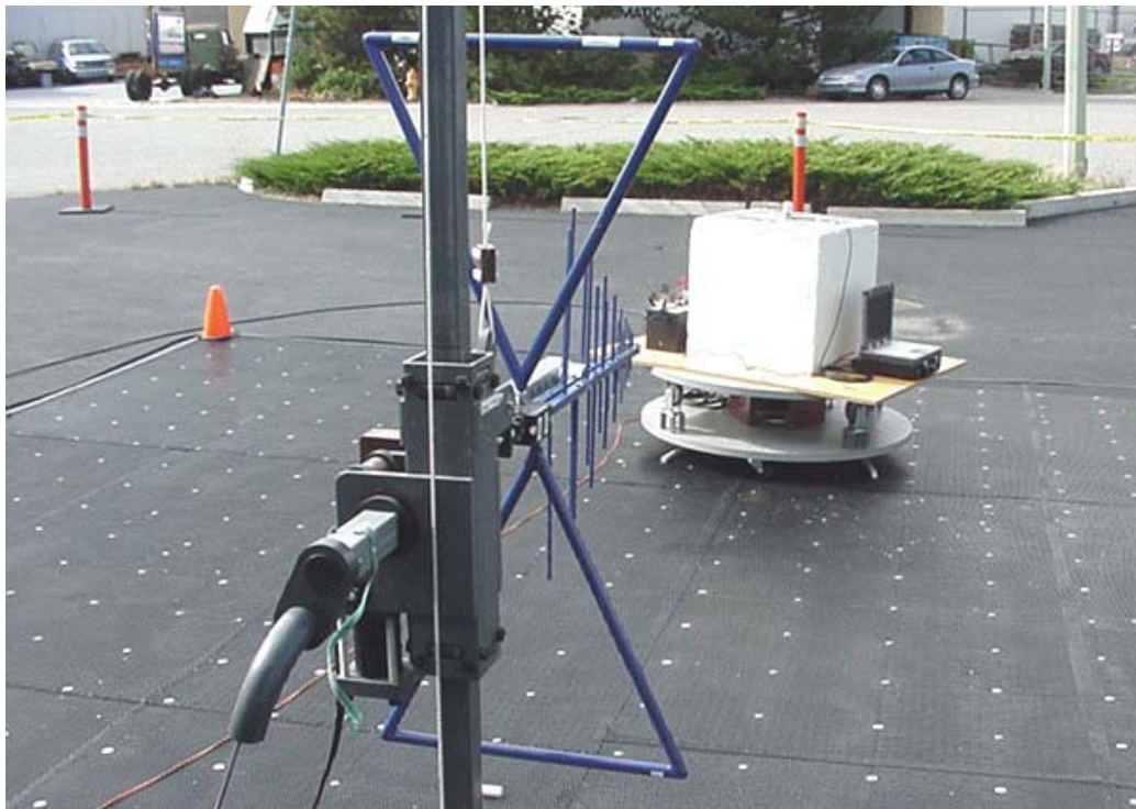
DUT Cellular Band with Bilog receive antenna