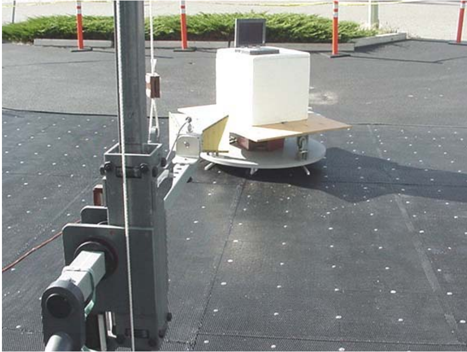
DUT PCS Band with Horn receive antenna