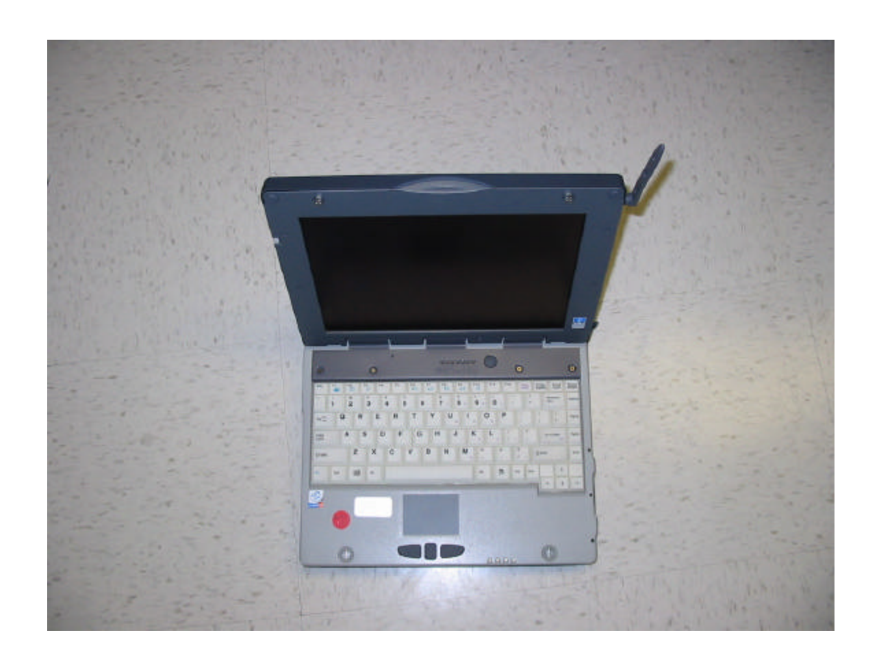
Photo 1 of 7 Antenna #1 – 3 Inch Blade Antenna Front View of IX260 PC – Blade Antenna located upper right side of display.