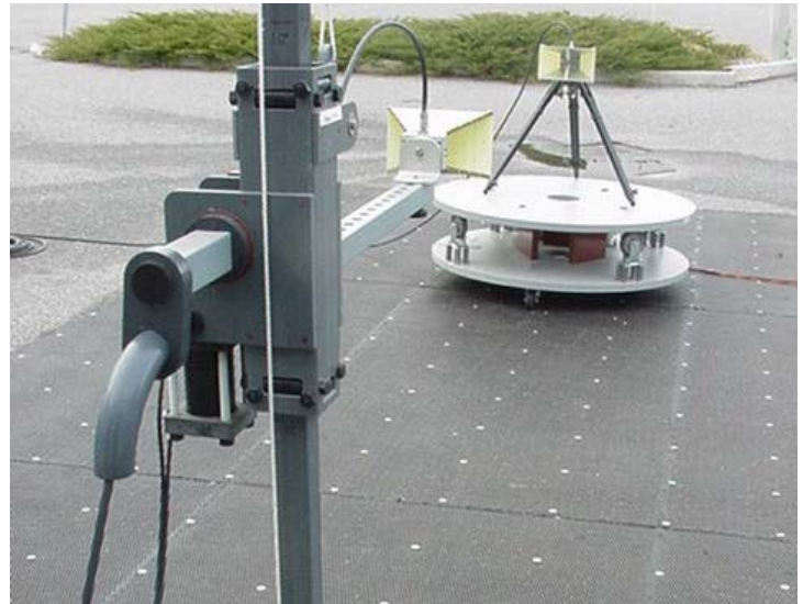
Signal Substitution Test Setup