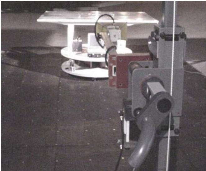
Radiated Measurement Test Setup