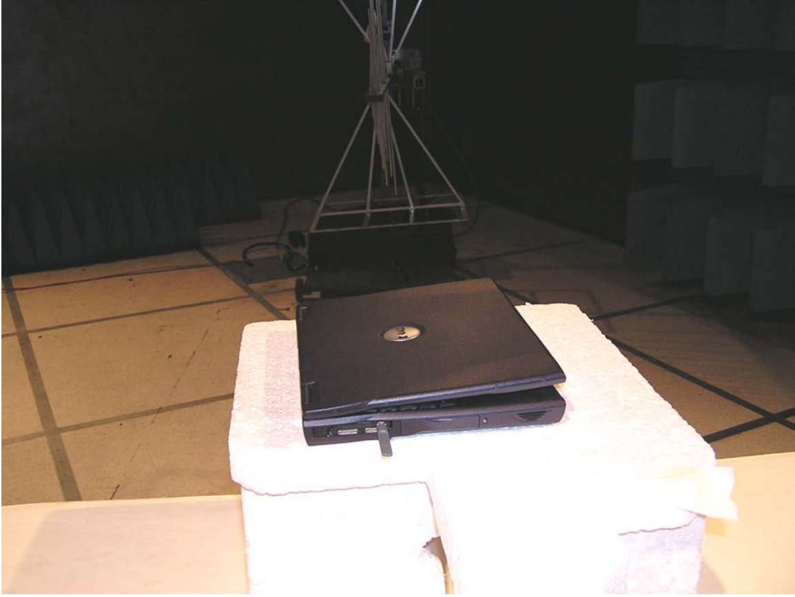
Test setup – Radiated Emissions