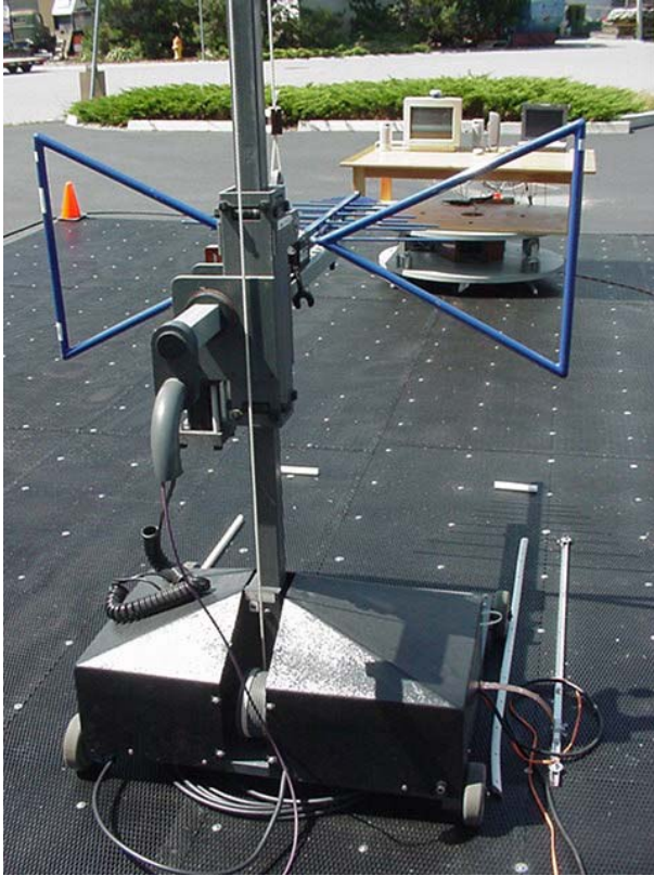
Photograph E-1 - Horizontal Polarization (30MHz – 1 GHz)