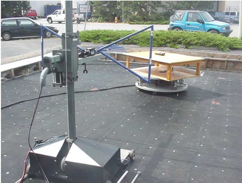
Photograph C.7-1 - Bilog Receive Antenna with IX100X and Nearson Helix Antenna Configuration