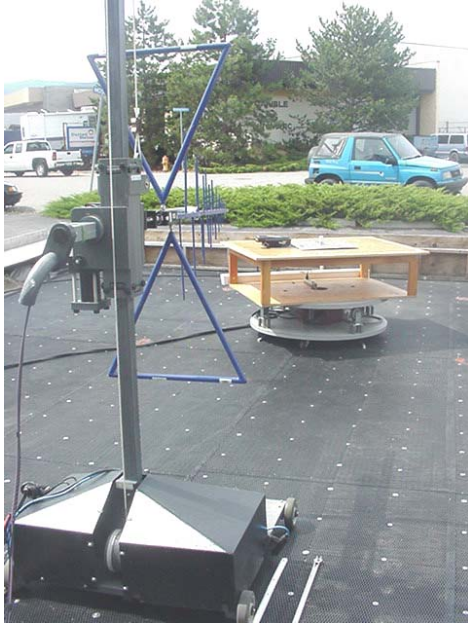
Photograph C.7-5 - Bilog Receive Antenna with IX100X and MaxRad Vehicle-Mount Antenna Configuration