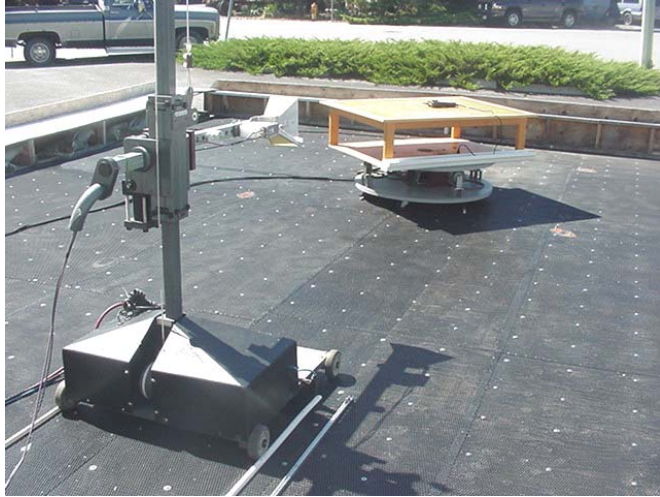
Photograph D.7-1 - BiConilog Receive Antenna with IX100X and Nearson Helix Antenna Configuration