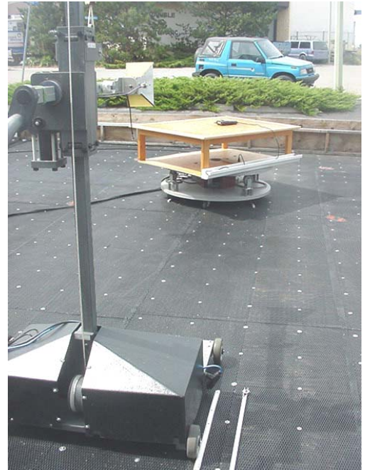
Photograph C.7-2 - Horn Receive Antenna with IX100X and Nearson Helix Antenna Configuration