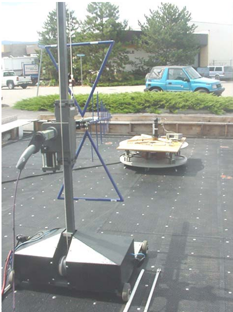
Photograph C.7-7 - Dipole Substitution Setup