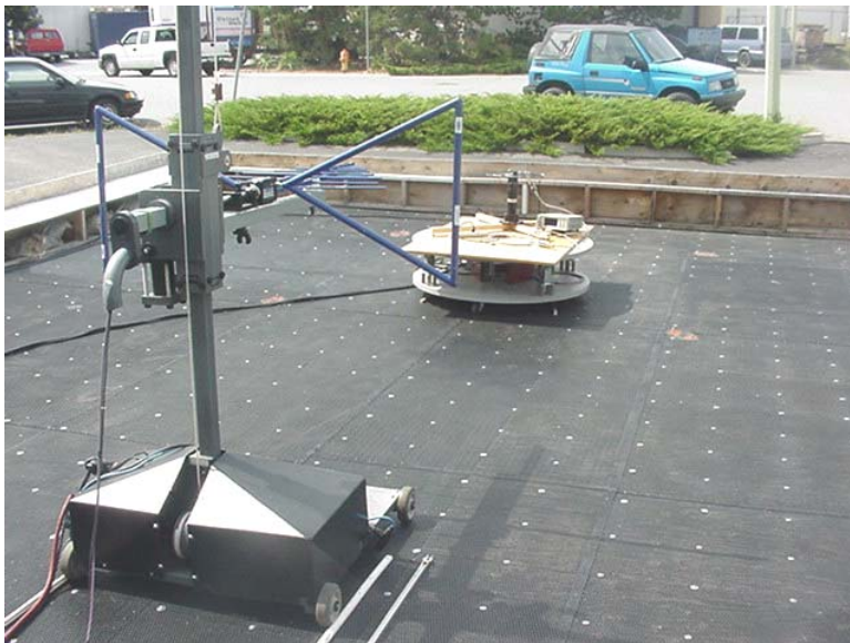
Photograph C.7-3 - Dipole Substitution Setup