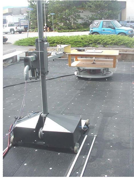
Photograph C.7-6 - Horn Receive Antenna with IX100X and MaxRad Vehicle-Mount Antenna Configuration