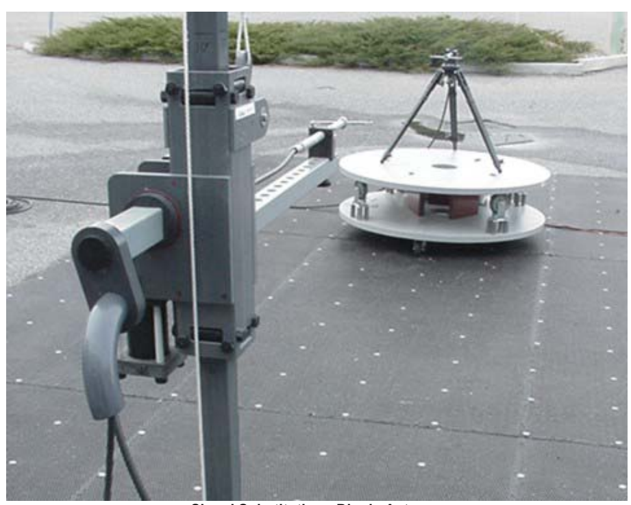
Signal Substitution - Dipole Antenna