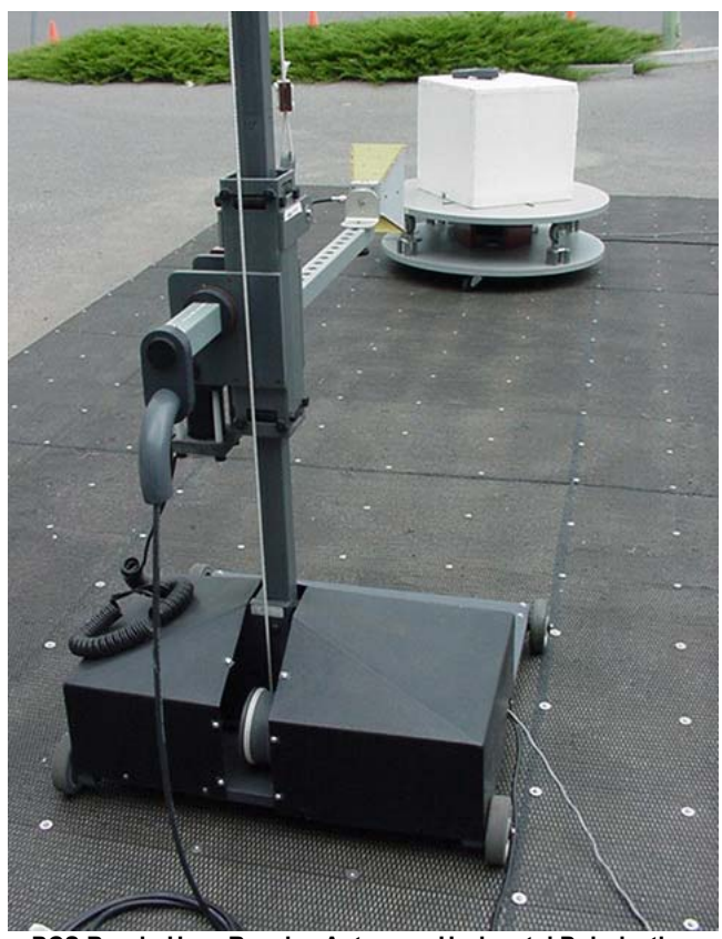
PCS Band - Horn Receive Antenna - Horizontal Polarization