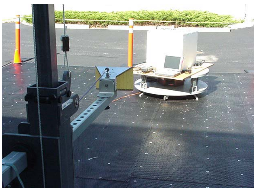
PCS Band with Horn Receive Antenna

DUT With Itronix Vehicle Cradle & MaxRad 3 dBi Gain Vehicle-Mount Antenna