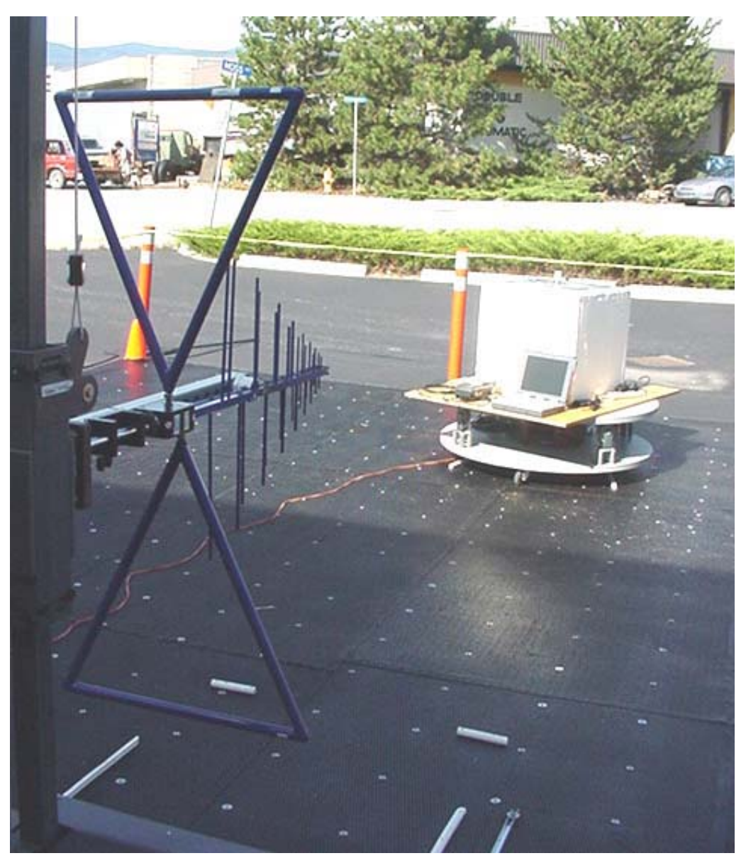
Cellular Band with BiConiLog Receive Antenna