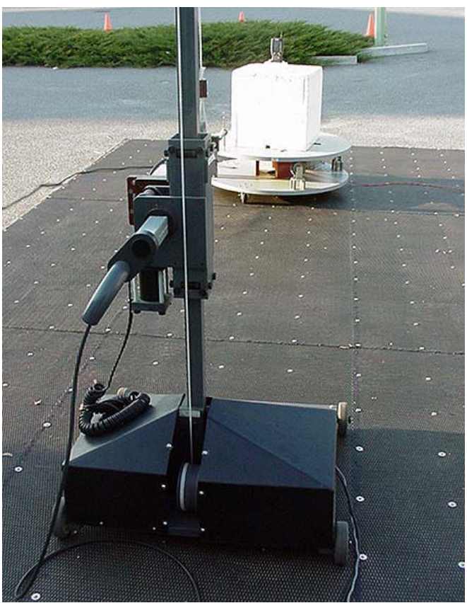
Cellular Band - Dipole Receive Antenna - Vertical Polarization