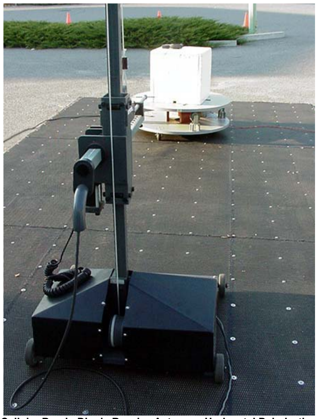
Cellular Band - Dipole Receive Antenna - Horizontal Polarization