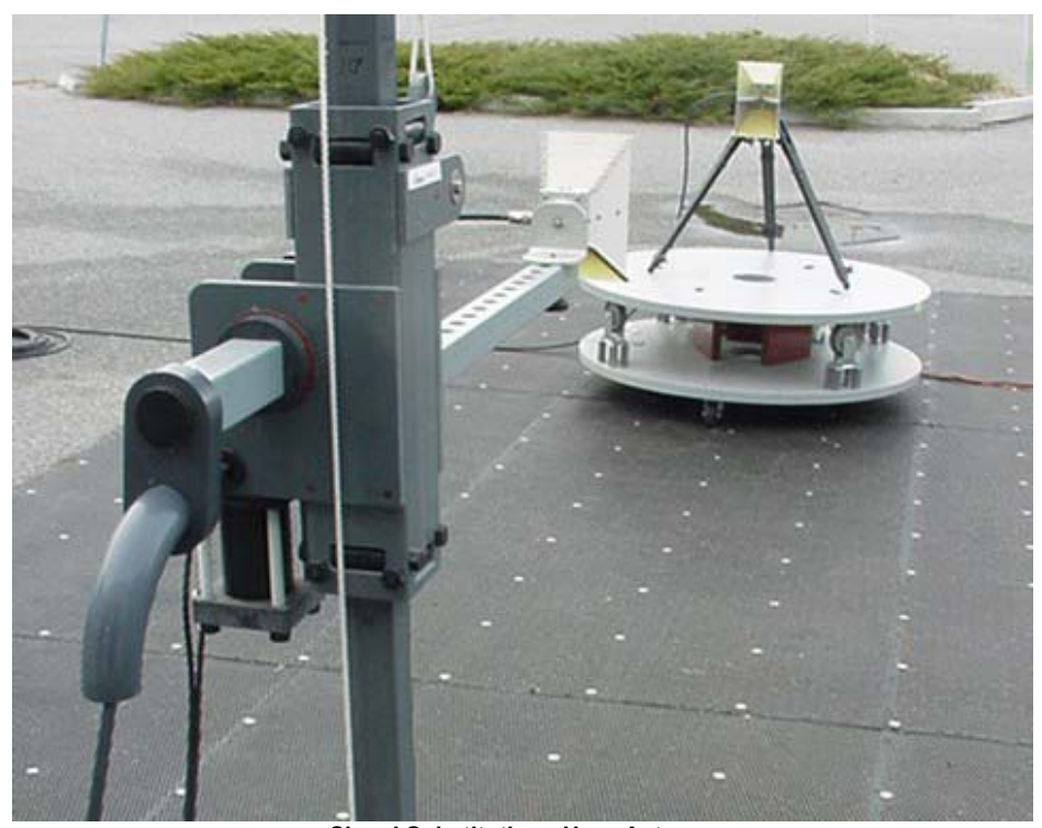
Signal Substitution - Horn Antenna