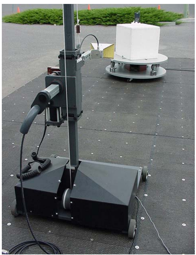
PCS Band - Horn Receive Antenna - Vertical Polarization