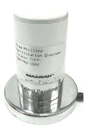
MaxRad 3 dBi Gain Vehicle-Mount Antenna P/N: WMLPVDB800/1900