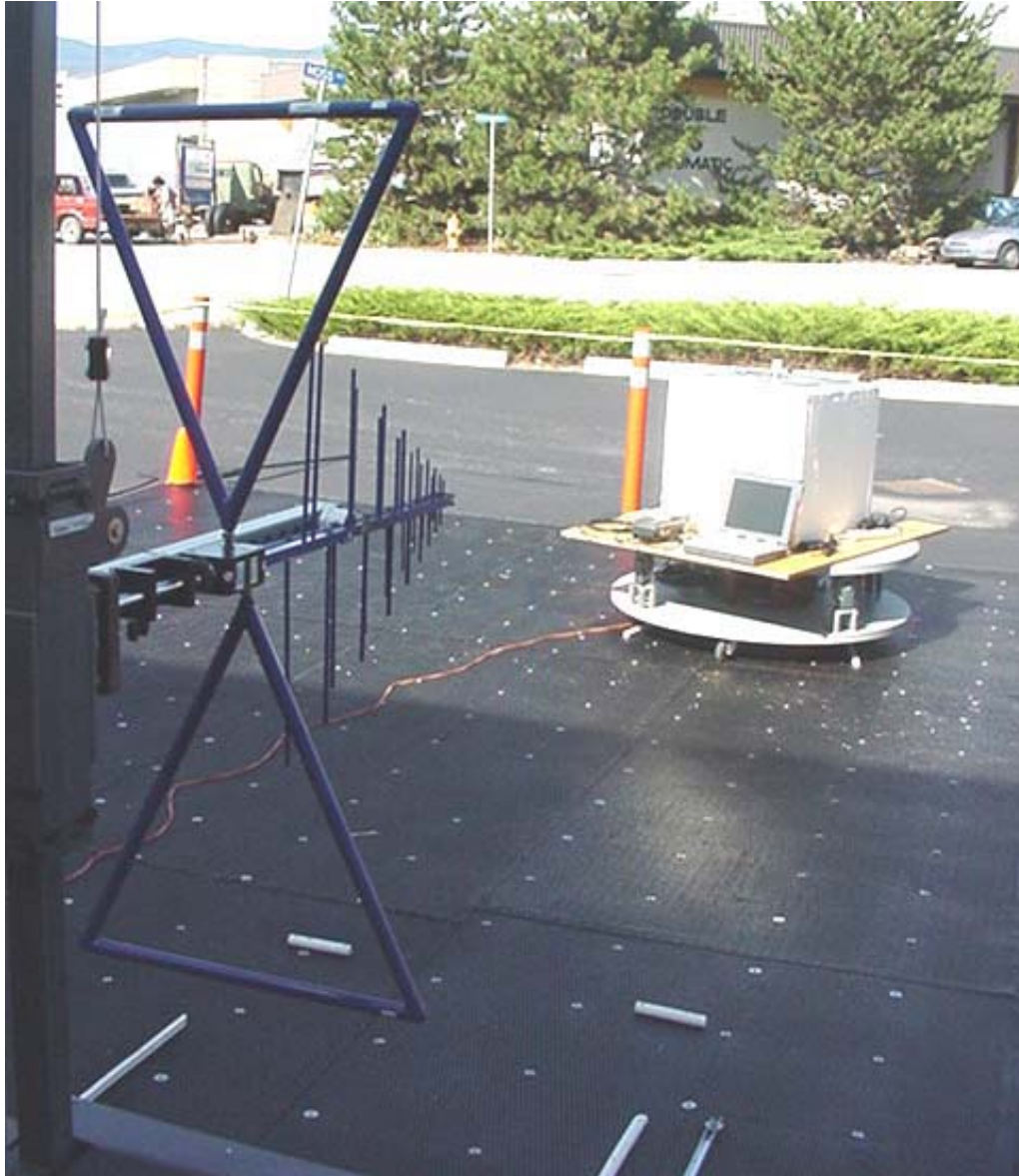
With BiConiLog Receive Antenna