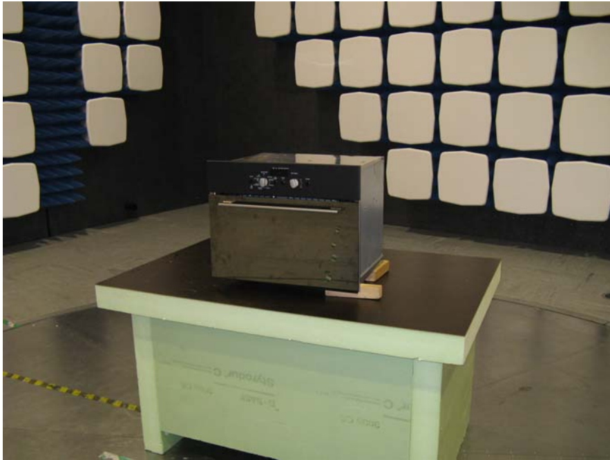
Radiated spurious emission 30-1000 MHz