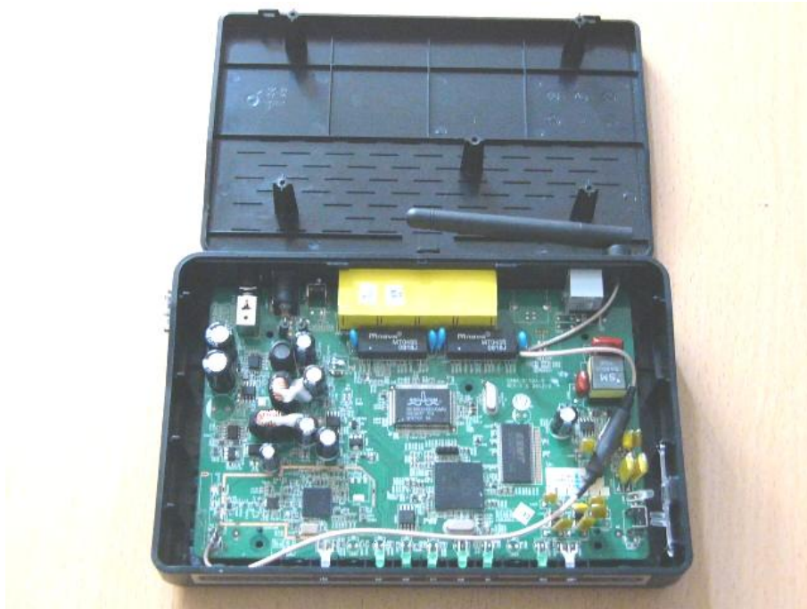
Main & RF board component side