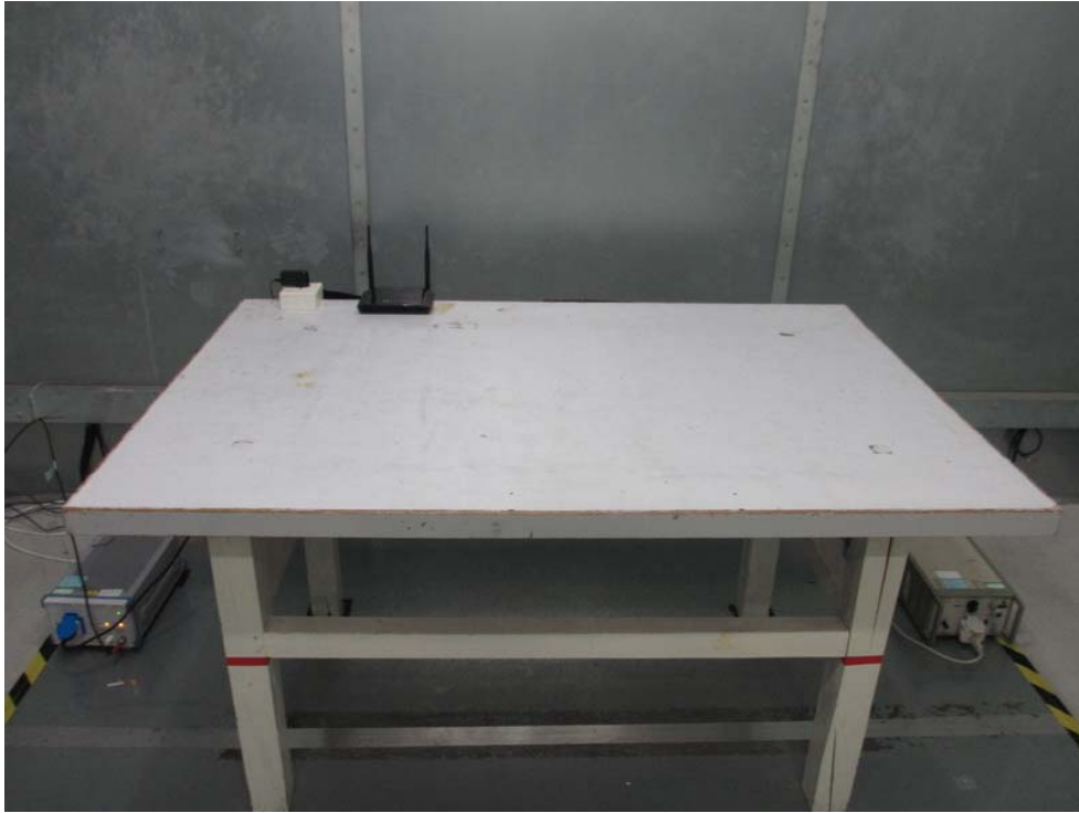
Conducted Measurement Photos Adapter: S06A22-120A050-PB