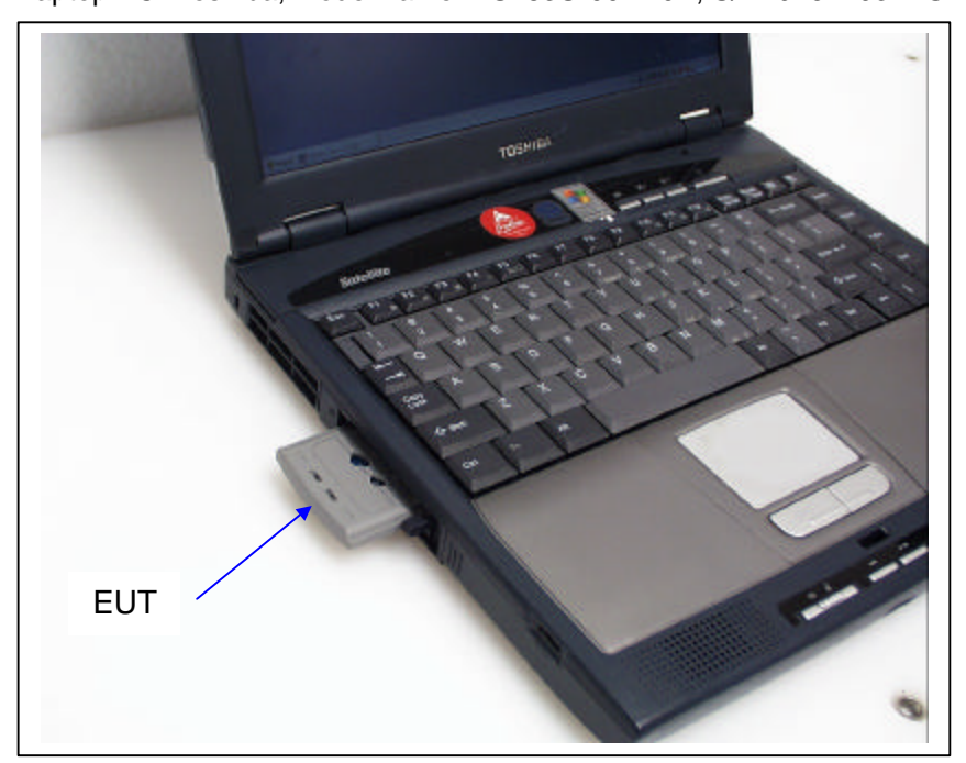
Laptop PC: Toshiba, model name: PS183U-00KP0X, S/N: 91617937PU