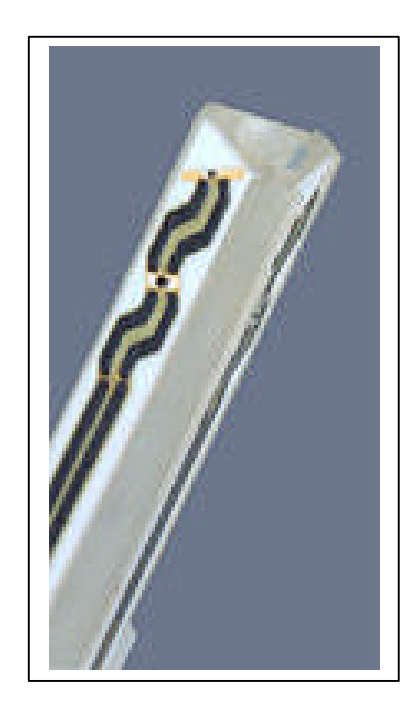
Inside view of ET3DV6 E-field Probe