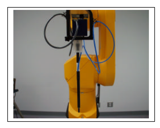
Photograph of the probe

The SAR measurements were conducted with the dosimetric probe ET3DV6 designed in the classical triangular configuration and optimized for dosimetric evaluation. The probe is constructed using the thick film technique; with printed resistive lines on ceramic substrates. The probe is equipped with an optical multi-fiber line ending at the front of the probe tip. It is connected to the EOC box on the robot arm and provides an automatic detection of the phantom surface. Half of the fibers are connected to a pulsed infrared transmitter, the other half to a synchronized receiver. As the probe approaches the surface, the reflection from the surface produces a coupling from the transmitting to the receiving fibers. This reflection increases first during the approach, reaches maximum and then decreases. If the probe is flatly touching the surface, the coupling is zero. The distance of the coupling maximum to the surface is independent of the surface reflectivity and largely independent of the surface to probe angle. The DASY4 software reads the reflection during a software approach and looks for the maximum using a 2 nd order fitting. The approach is stopped when reaching the maximum.