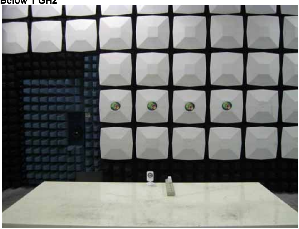
Below 1 GHz