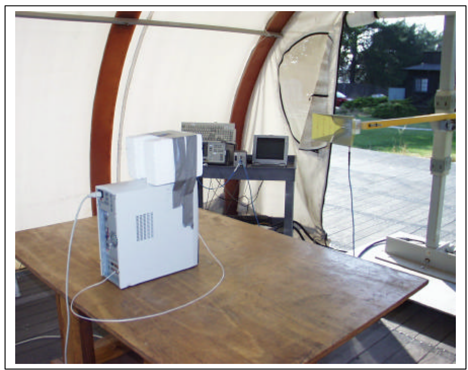
Page 55 of 57