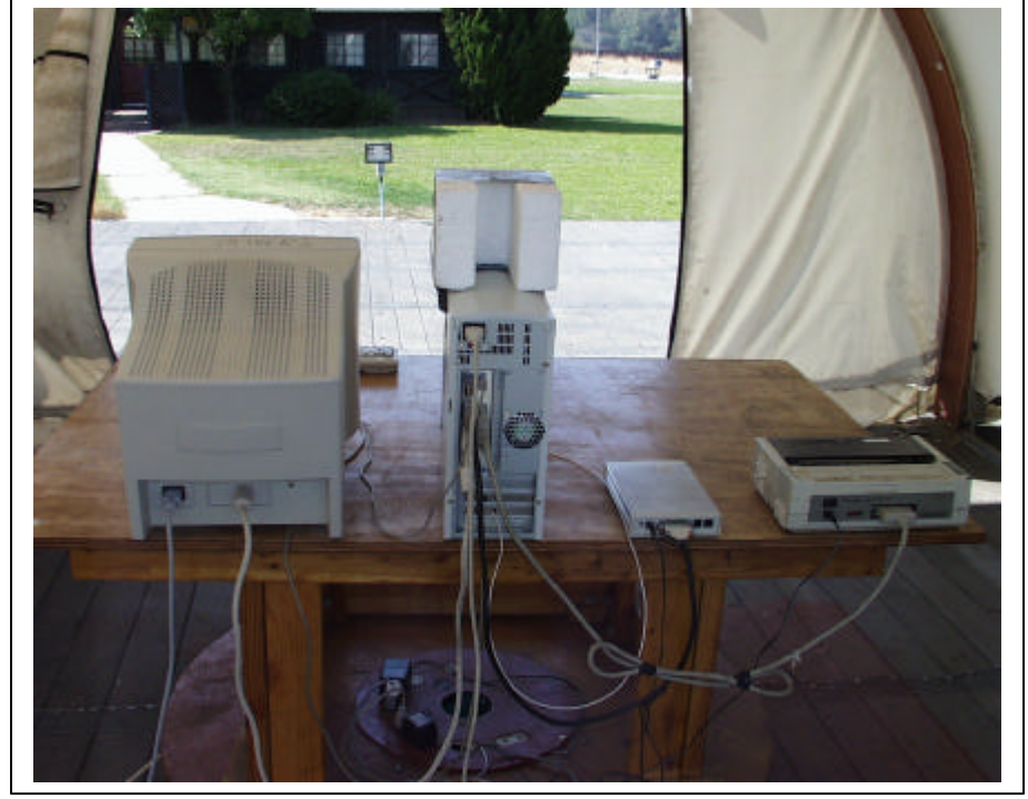
Page 56 of 57