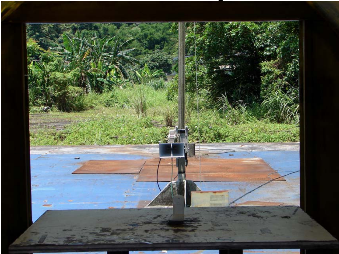
Rear View of The Test Configuration