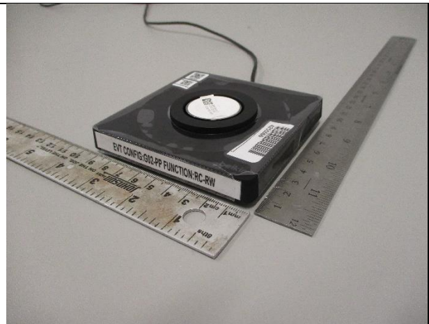
Angle view with inner base elevated