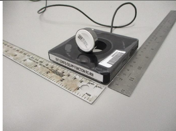
Angle view without inner base elevated, charging pad tilted upright