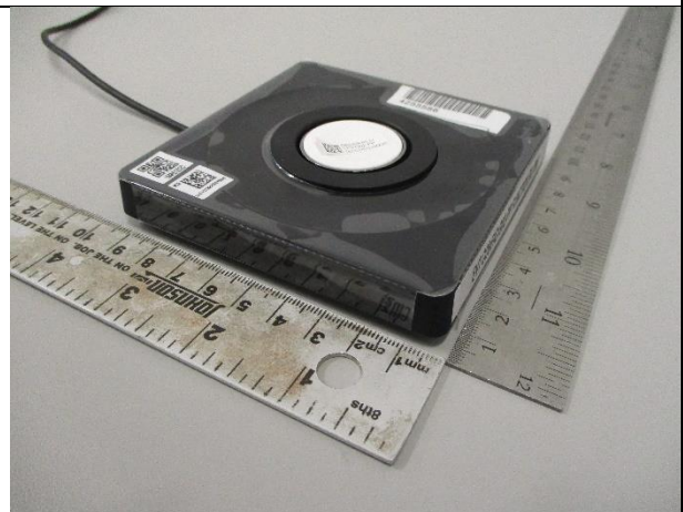
Angle view without inner base elevated