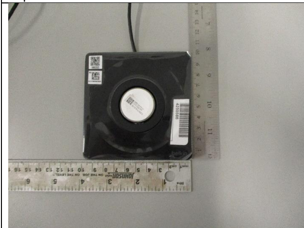
Top view without inner base elevated