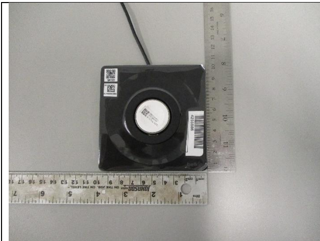
Top view with inner base elevated

Model: WIZ015 FCC ID: K7SWIZ015 IC: 3623A-WIZ015