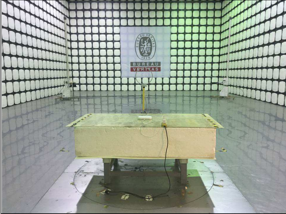
RADIATED EMISSION TEST < 9KHz~30MHz >