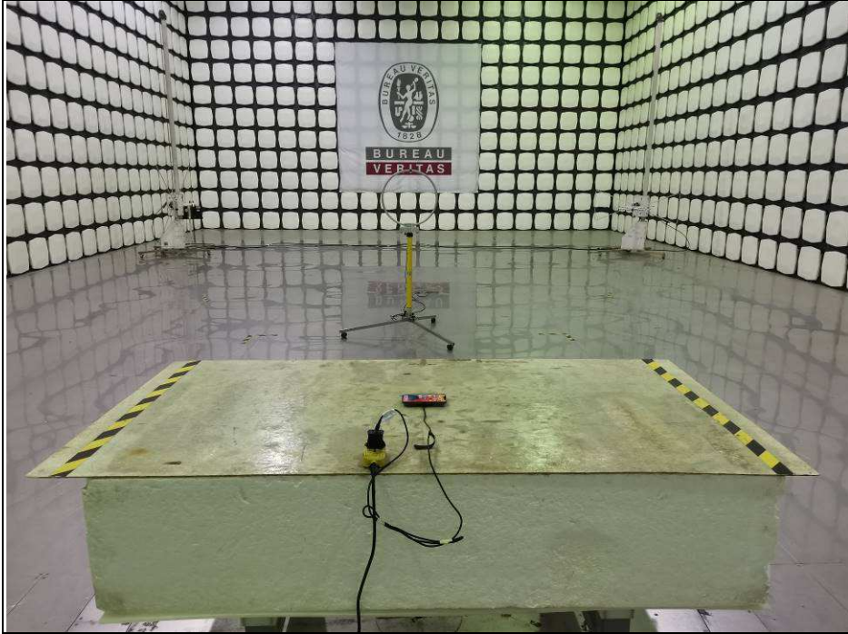
RADIATED EMISSION TEST < 9KHz~30MHz >