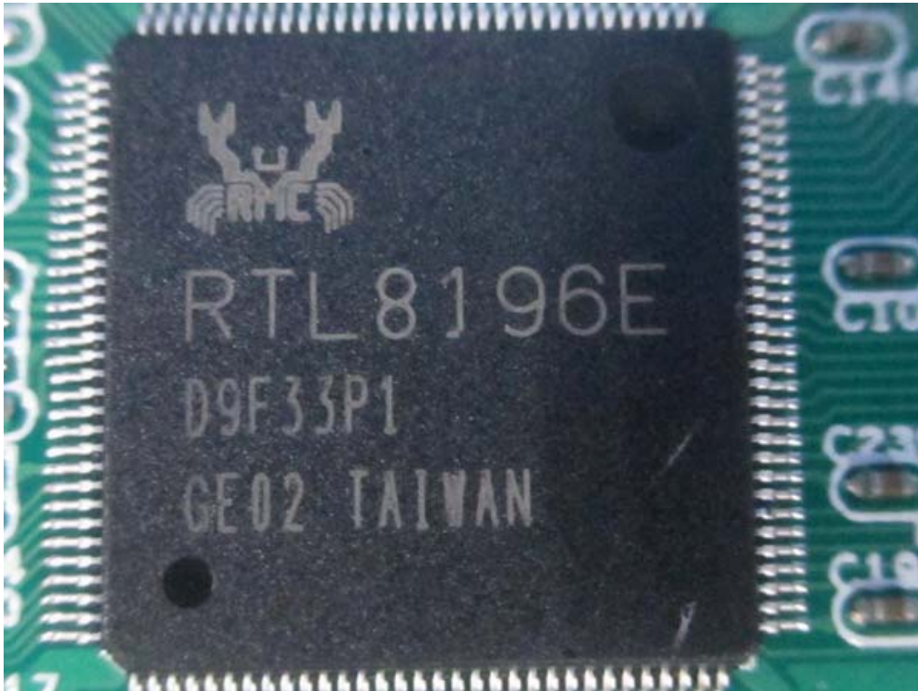
RF module IC