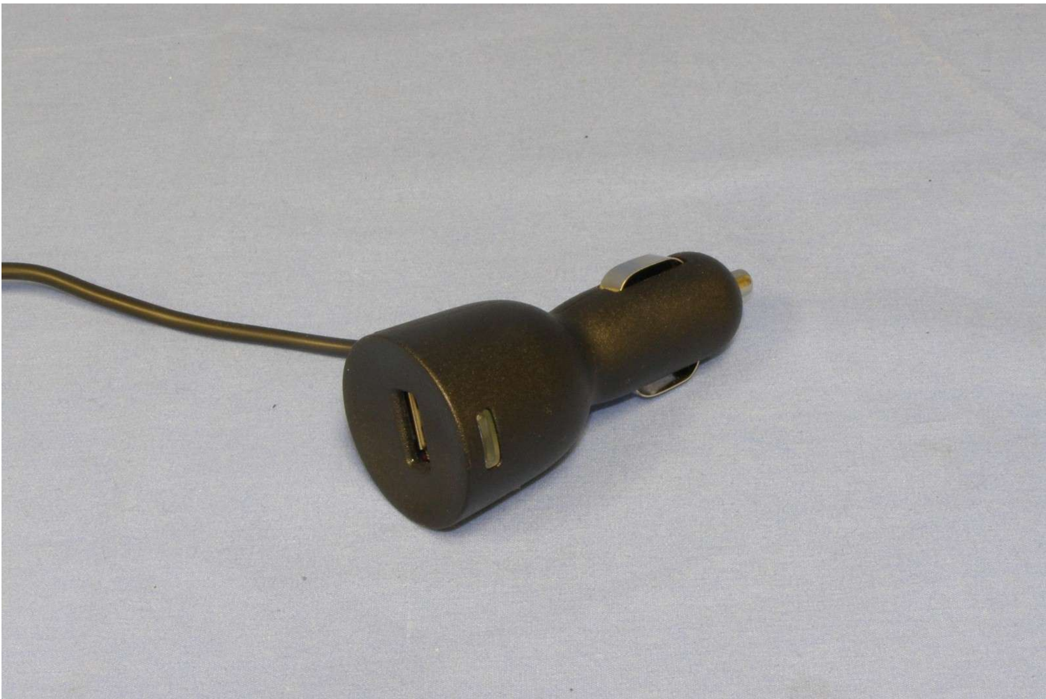
Photo 6 -- Front / Top of CLA