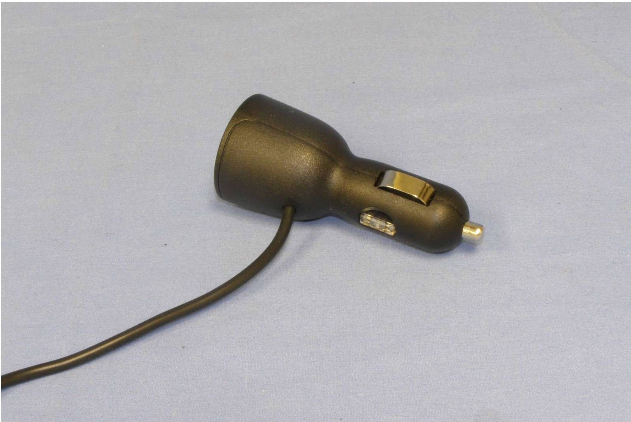
Photo 7 -- Bottom / Back of CLA