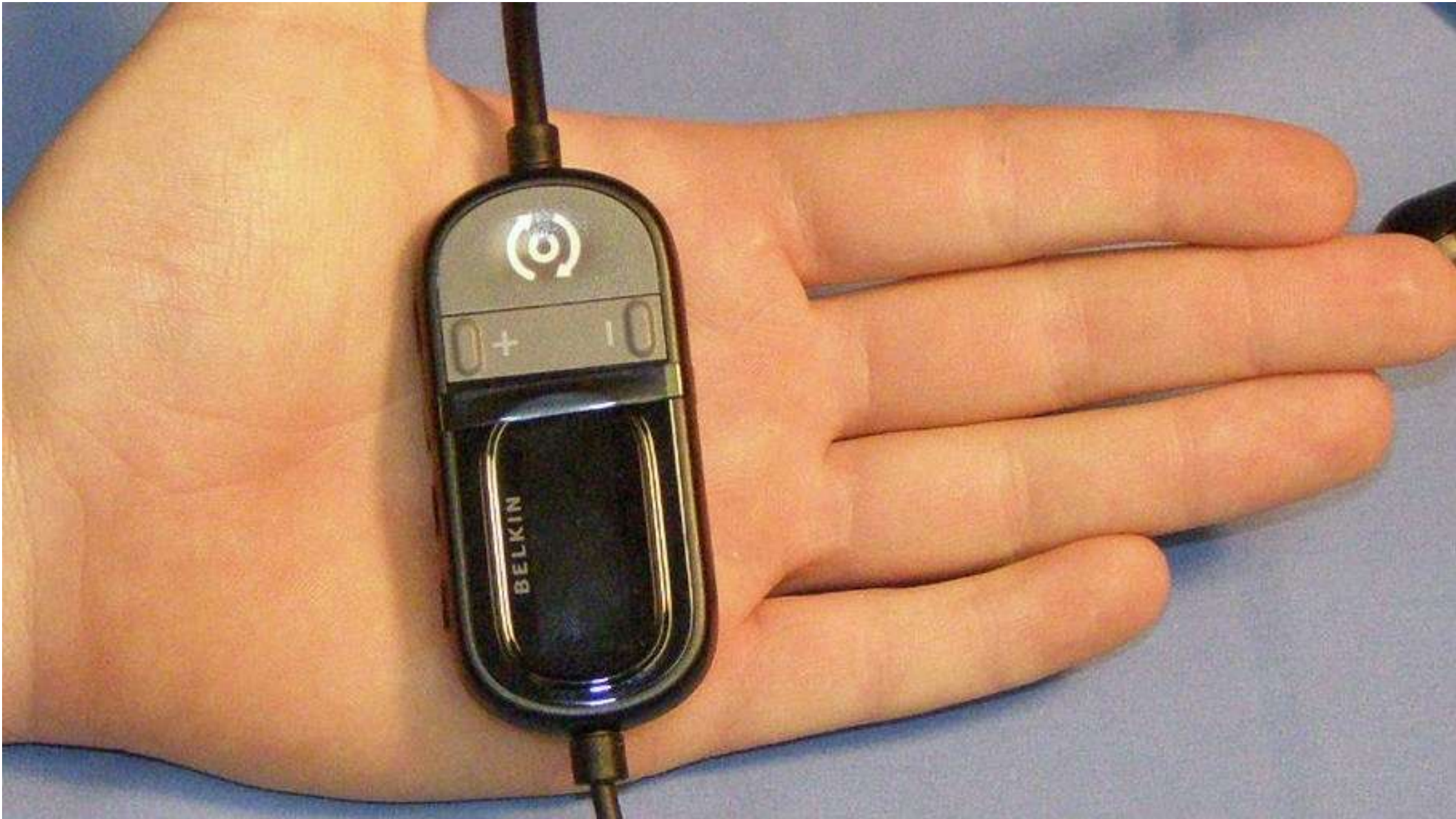
Photo 5 - Hand Held Device Photo