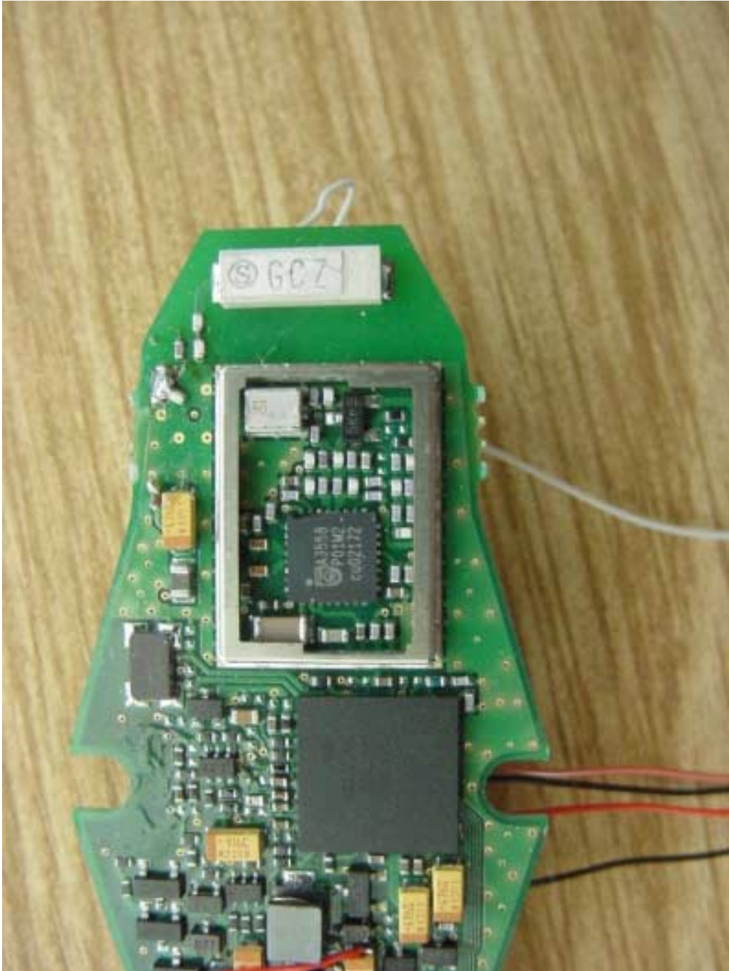
Photograph no.: 4