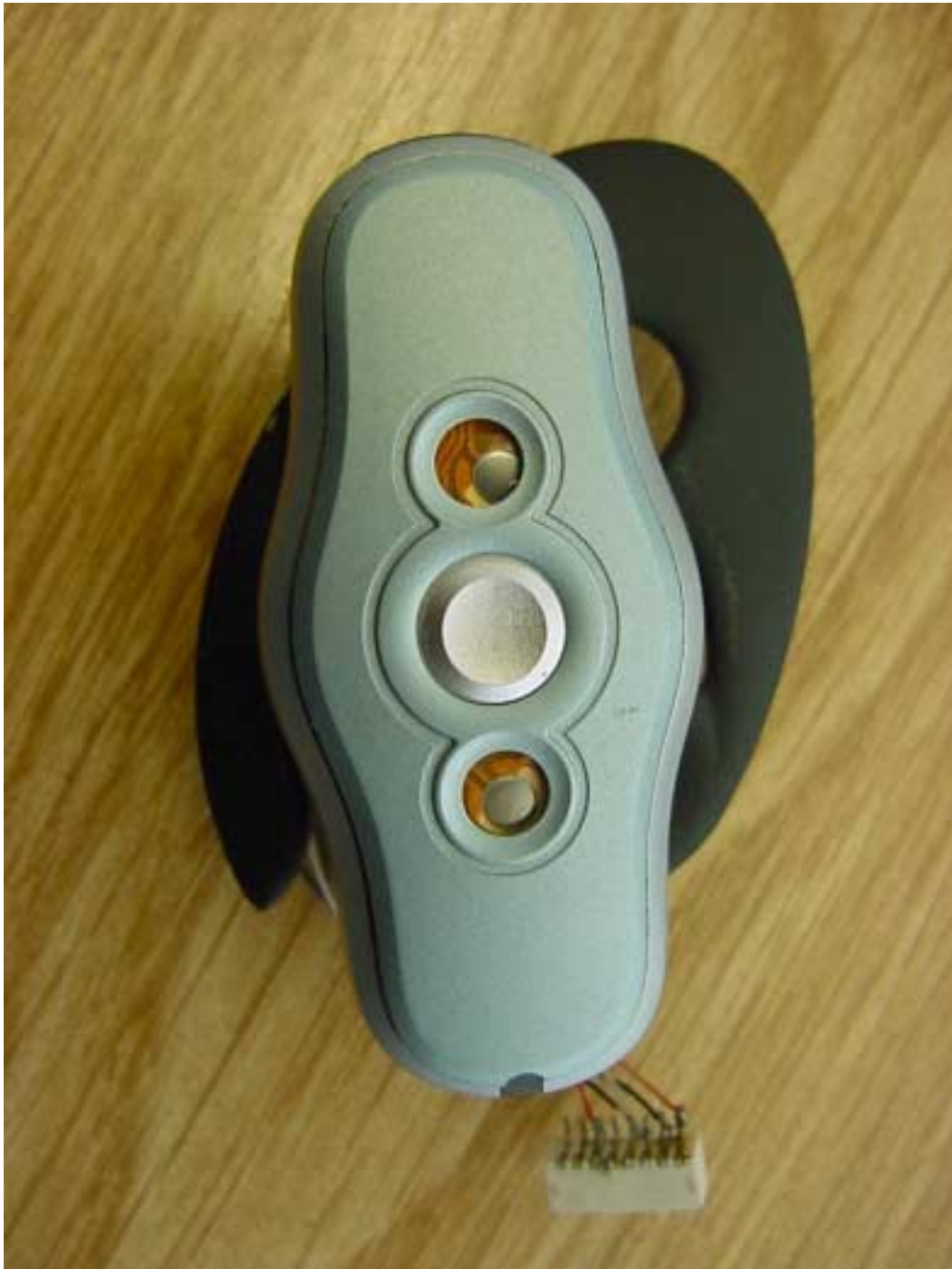
Photograph no.: 1