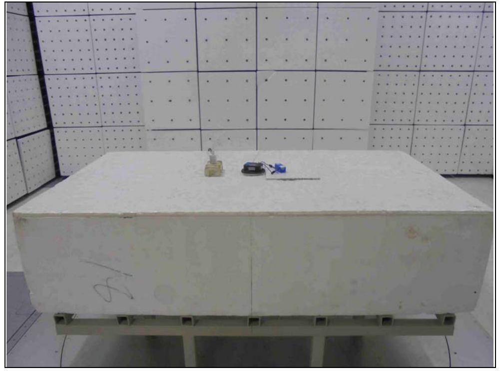
<Frequency Range above 30MHz>