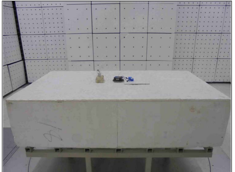
<Frequency Range below 30MHz>