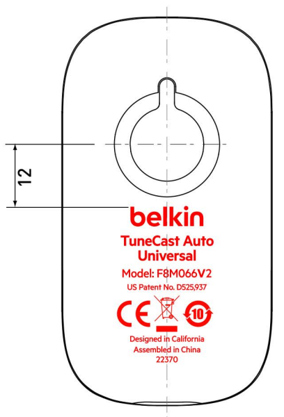
Transmitter REAR VIEW