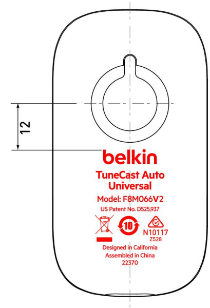
Transmitter REAR VIEW