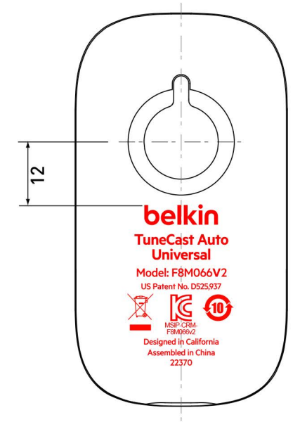
Transmitter REAR VIEW