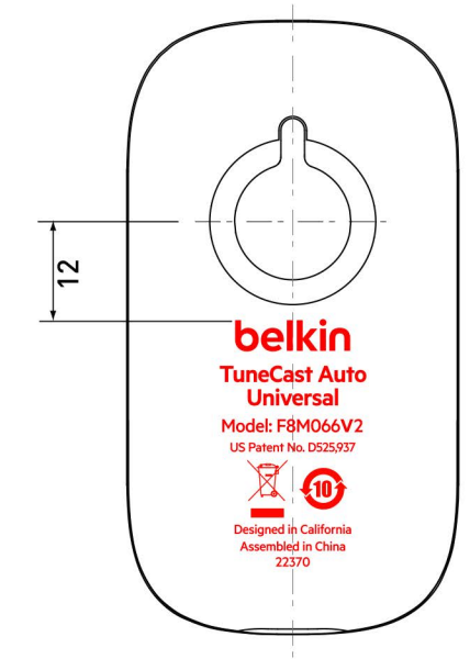
Transmitter REAR VIEW