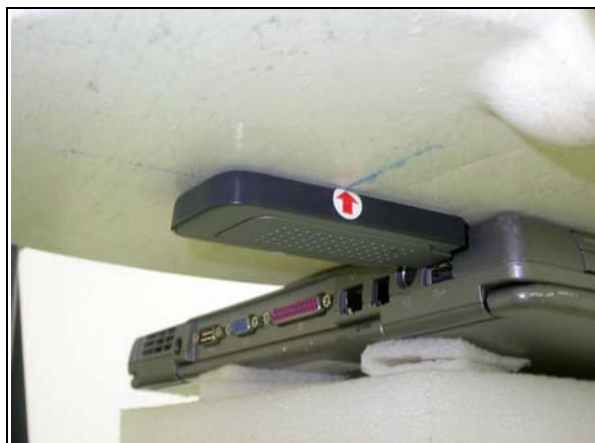
A: NOTEBOOK MODEL: D600

The following test configurations have been applied in this test report: