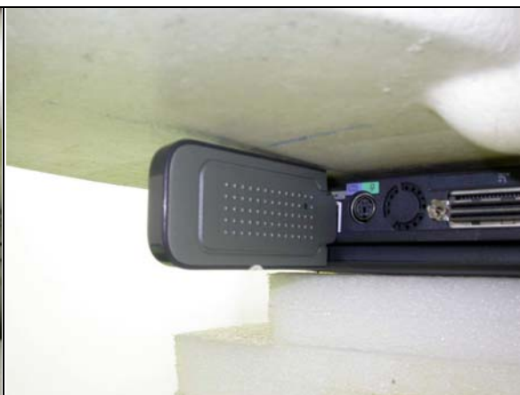
B: NOTEBOOK MODEL: C600

The bottom of the EUT face to the phantom with 0mm-separation distance.