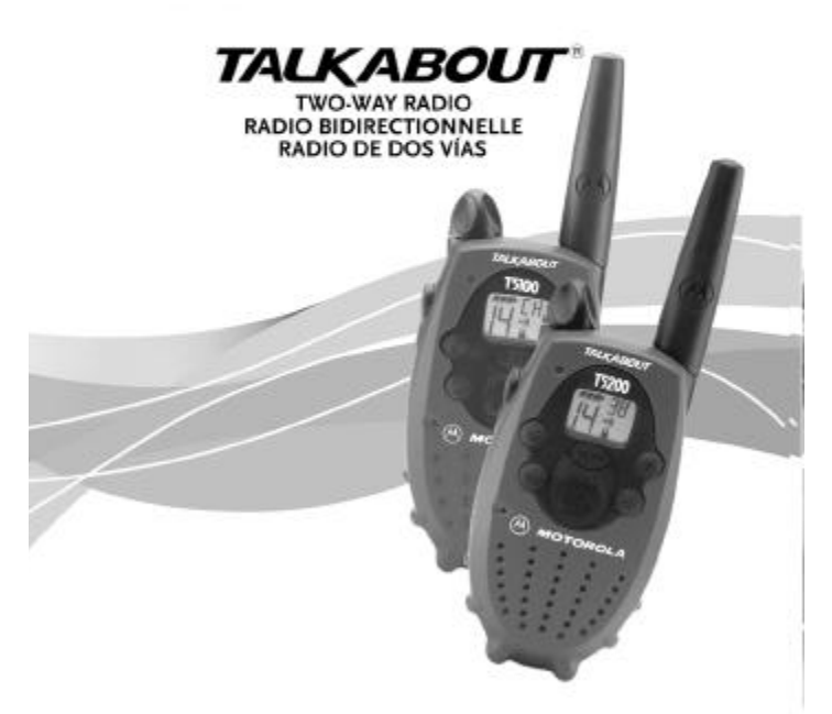
Models T5100 and T5200

User's Guide Manuel de l'Utilisateur Manual del Usuario