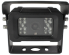
Rear view camera