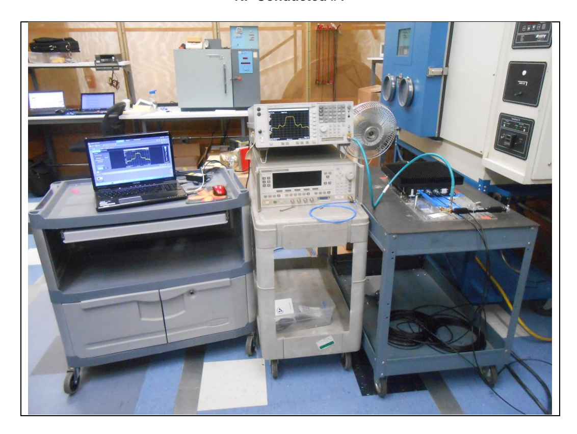
RF Conducted Temp Test #2