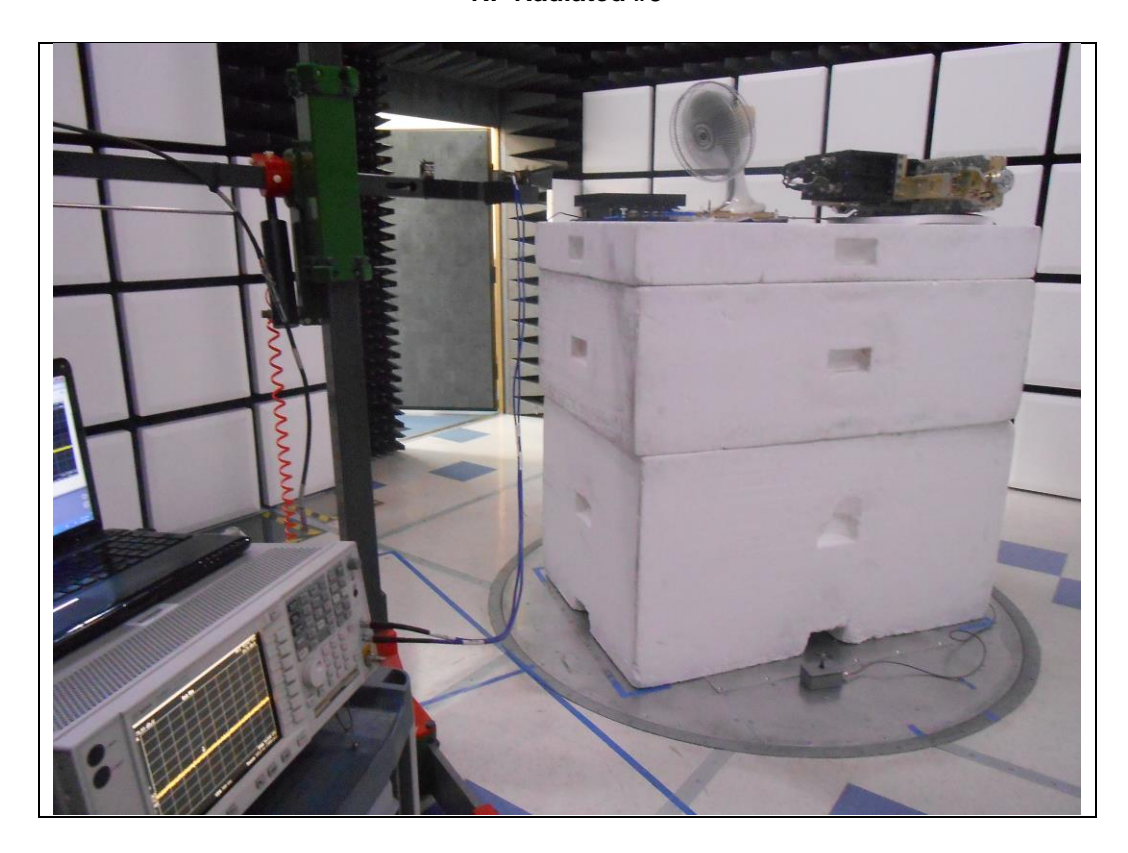
RF Radiated #4