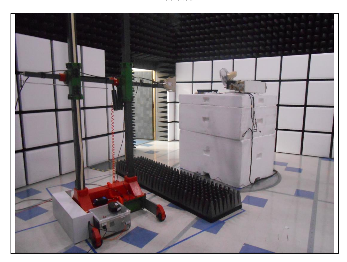
RF Radiated #2