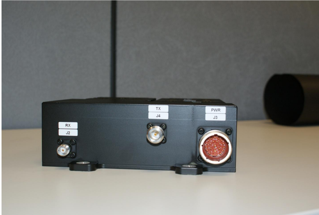
Figure 1: IPLD Front View

CONFIDENTIAL, UNPUBLISHED PROPERTY OF ONE OR MORE OF THE FOLLOWING - EMS TECHNOLOGIES CANADA, LTD., FORMATION INC., SKY CONNECT LLC (COLLECTIVELY "EMS AVIATION").