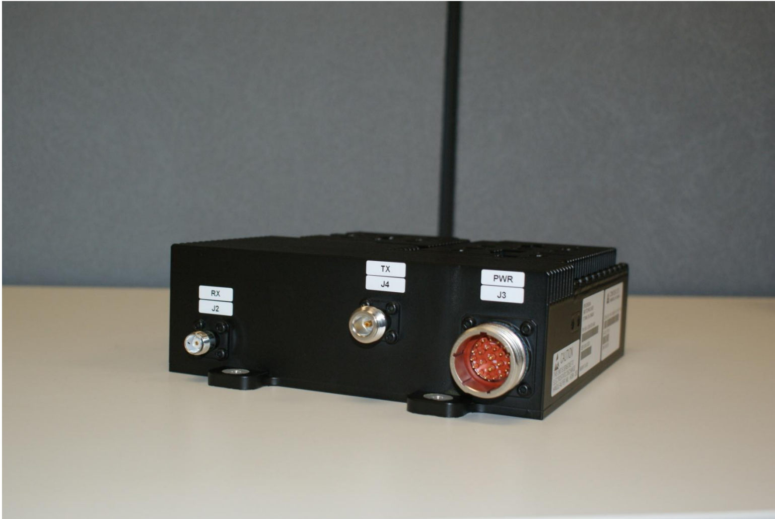
Figure 2: IPLD Isometric View

CONFIDENTIAL, UNPUBLISHED PROPERTY OF ONE OR MORE OF THE FOLLOWING - EMS TECHNOLOGIES CANADA, LTD., FORMATION INC., SKY CONNECT LLC (COLLECTIVELY "EMS AVIATION").