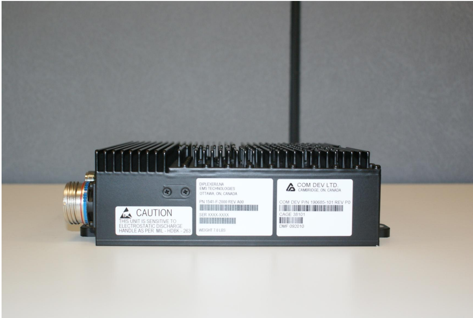
Figure 3: IPLD Side View

CONFIDENTIAL, UNPUBLISHED PROPERTY OF ONE OR MORE OF THE FOLLOWING - EMS TECHNOLOGIES CANADA, LTD., FORMATION INC., SKY CONNECT LLC (COLLECTIVELY "EMS AVIATION").