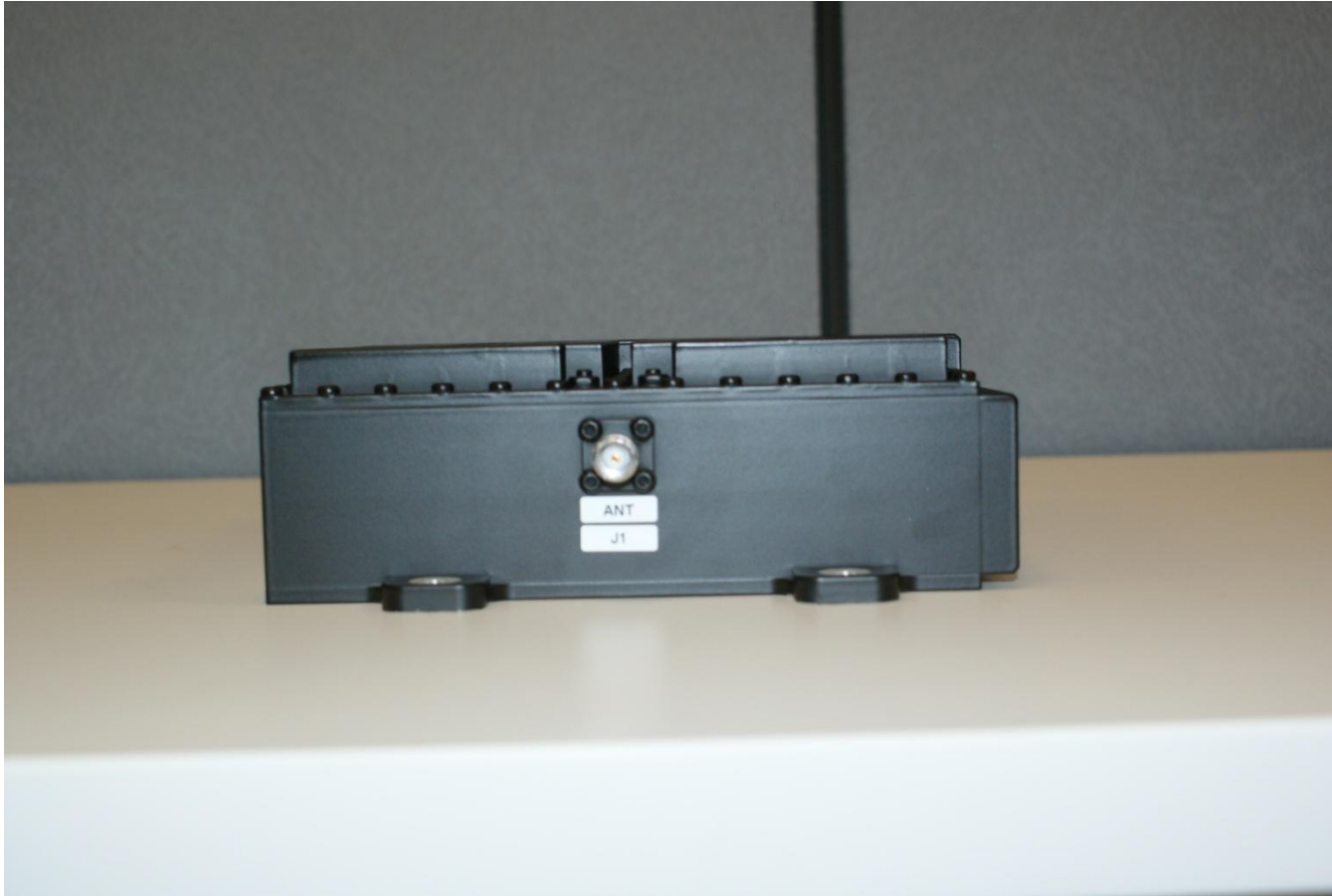
Figure 5: IPLD Back View

CONFIDENTIAL, UNPUBLISHED PROPERTY OF ONE OR MORE OF THE FOLLOWING - EMS TECHNOLOGIES CANADA, LTD., FORMATION INC., SKY CONNECT LLC (COLLECTIVELY "EMS AVIATION").